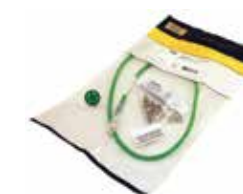
Bonding Jumper Kit