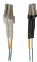
MSFP to LC MSFPLC50G3M1

Brocade is a registered trademark of Brocade Communications Systems, Inc.