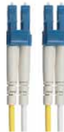
LC to LC Duplex, OS2 DFPCLCLCS1SM