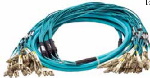
LC Fan-Out Trunk, OM3, 48-Strand