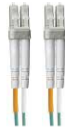
LC to LC Duplex, OM3 DFPCLCLCE1MM

Replace yy with standard stock lengths of 1, 2, 3, 4 or 5 meters. Longer lengths 6 to 25 meters available in Plenum. Longer lengths 5 to 10 meters available in Riser. Custom lengths quoted to order.