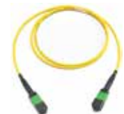
MPO 12-Strand, OS2 FPCPMTPS3FN