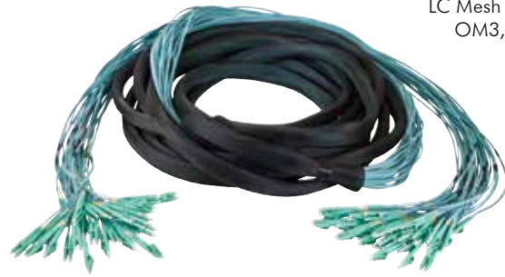
LC Mesh Bundle Trunk, OM3, 48-Strand