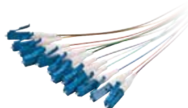
Pigtail Bundle, LC 12-Strand, OS2 FPBKR12LC6S

Buffer Color Code Sequence: Blue, Orange, Green, Brown, Slate, White, Red, Black, Yellow, Violet, Rose, Aqua