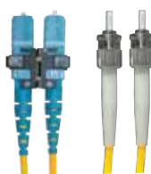
SC Duplex to ST-style Duplex OS2 DFRCSTSCS1SM