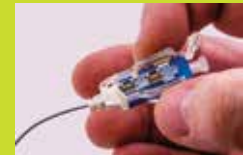
Insert and Click