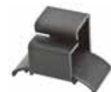
Bend Radius Clip FBRMGTCPLPK4