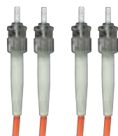
ST to ST Duplex, OM1 DFRCSTSTC1MM