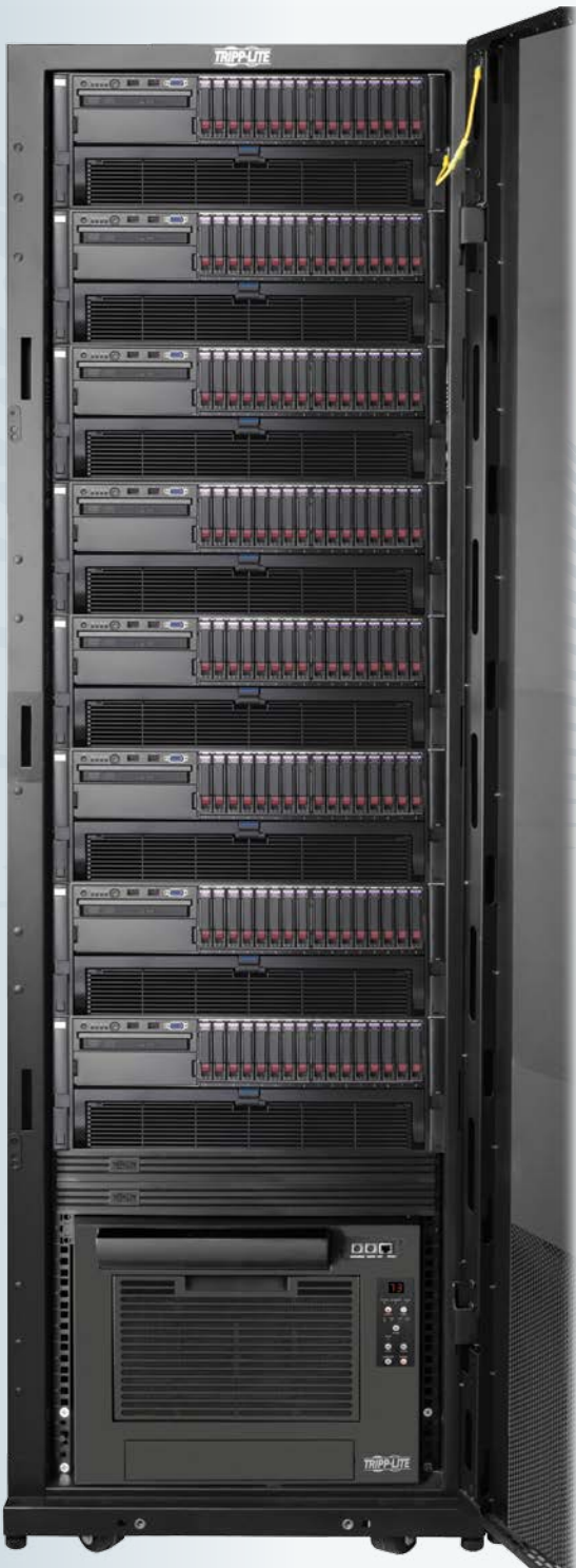
SRCOOL7KRM mounted at the bottom of a 42U rack enclosure.