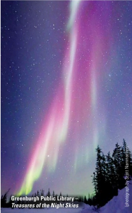
Greenburgh Public Library – Treasures of the Night Skies