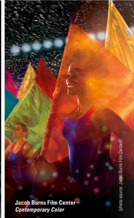
Jacob Burns Film Center – Contemporary Color