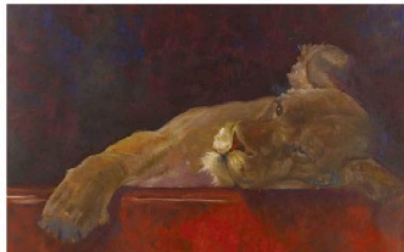
Lioness at Rest by B F Sheppard

Beginning July 9, transFORM Gallery presents Rescue Me , a juried exhibition in collaboration with the Humane Society of Westchester (HSW). The animal-themed show represents both domestic and wild animals, from kittens to lions, through