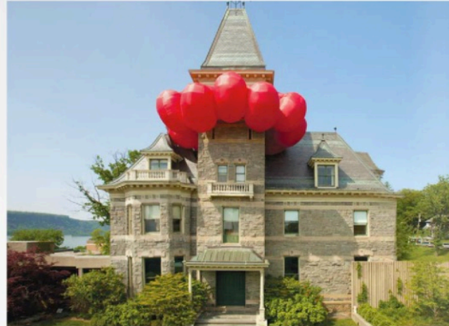
Super Punch Bubbles by Jimmy Kuehnle

Giant inflatable tongues protrude from the entranceway of Hudson River Museum this summer. In the first large-scale solo exhibition by Jimmy Kuehnle, witty site-specific sculptures invade both inside and outside of the Museum's space. Giant yellow lungs "breathe" by inflating and deflating; a three-story-high creature creates playful interaction as guests walk between its legs; fabric bubbles emerge from tower windows, functioning as an illuminated clock that blinks with the changing of hours. Conceived and constructed by Kuehnle, the massively-scaled structures elicit a response from visitors as they are forced to confront the works. According to Kuehnle, "the scale [of the work] is intended to overwhelm and encompass the viewer and take on a dialogue with the architecture and environment of the museum." Each new piece, placed in each new location, challenges the artist as well. Depending on the space, the works require new construction and problem solving, challenging him with new techniques, technology, weather and wind. Tongue in Cheek: The Inflatable Art of Jimmy Kuehnle is on view through September 18. For more info, visit: hrm.org .