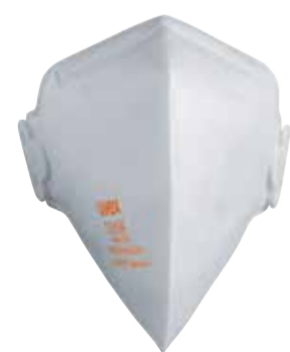
8733-208 FFP2 without valve