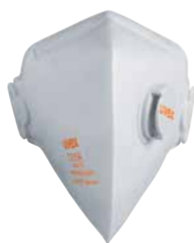
8733-218 FFP2 with valve