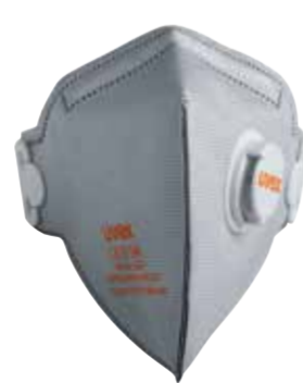
8733-228 FFP2 with valve and carbon

FFP2 respirators are intended for use against both mechanically and thermally generated particulates in concentrations up to ten times exposure standard.