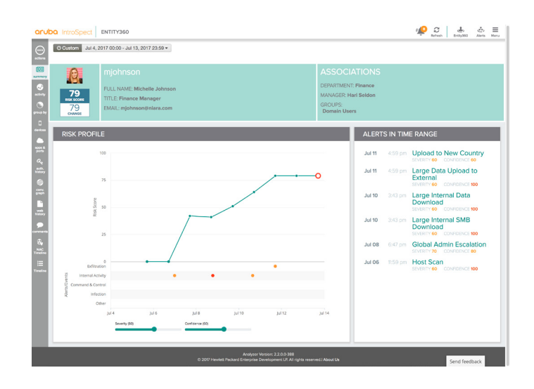
Figure 2: Consolidated forensic information in an Entity360 profile