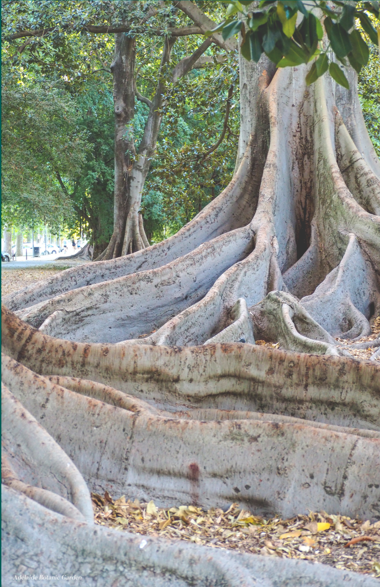
Adelaide Botanic Garden