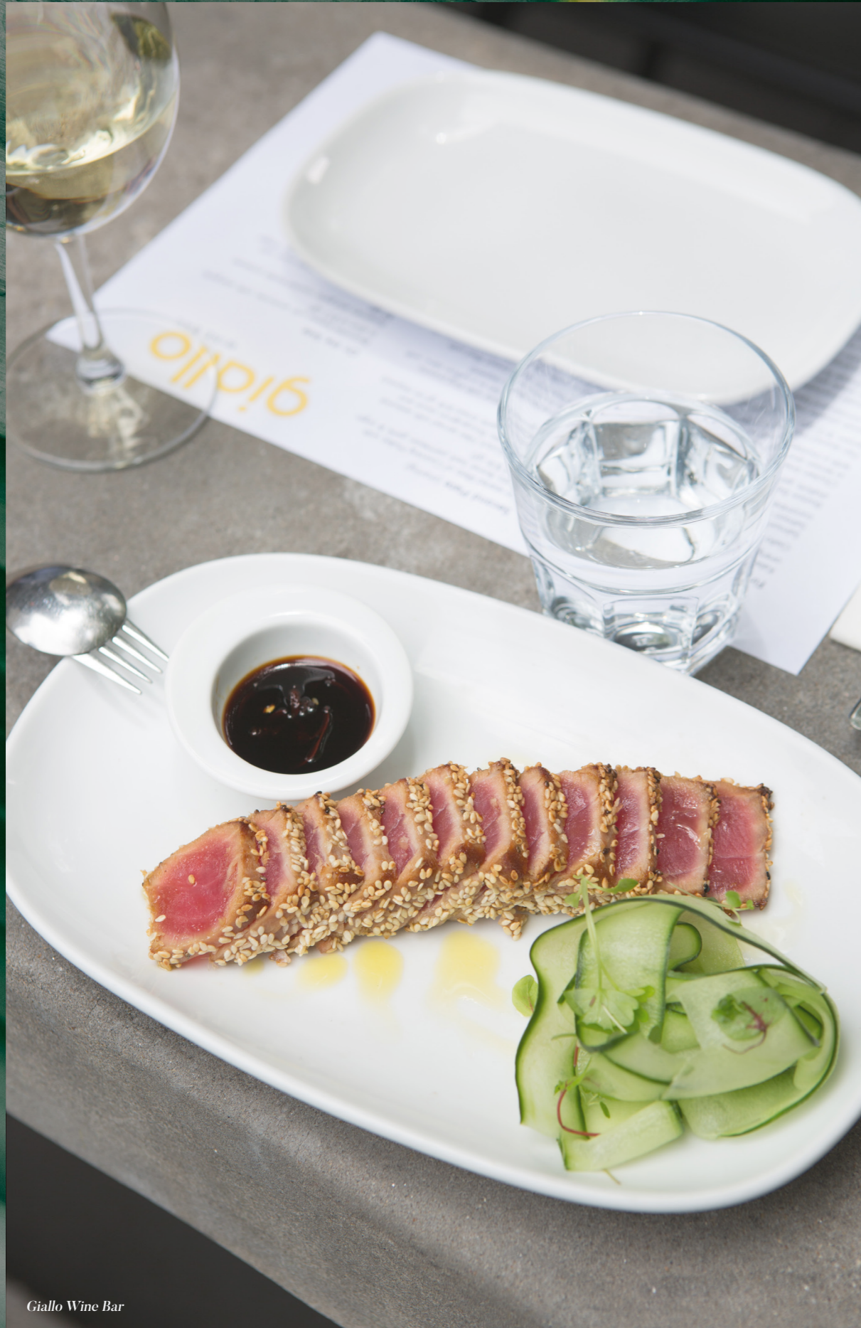
Giallo Wine Bar