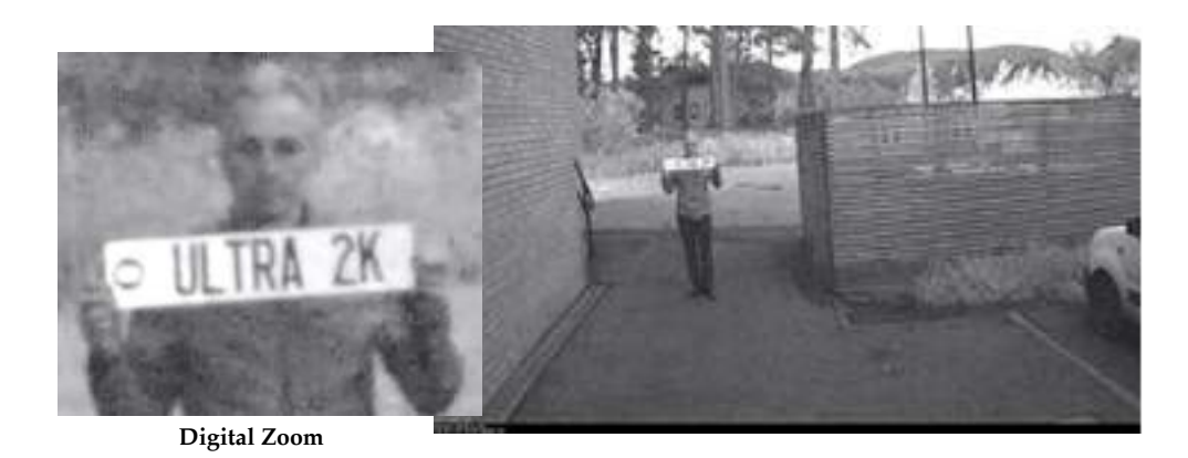
IndigoVision Ultra Camera