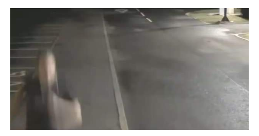
Standard HD Camera

Another factor when it comes to low light performance, a significant trend has been the move to have cameras maintain their colour mode, even at night. The downside, which vendors don't tend to mention in their datasheets, is that staying in colour mode can result in more noise, lower detail, and object blurring under high motion due to low shutter speeds.