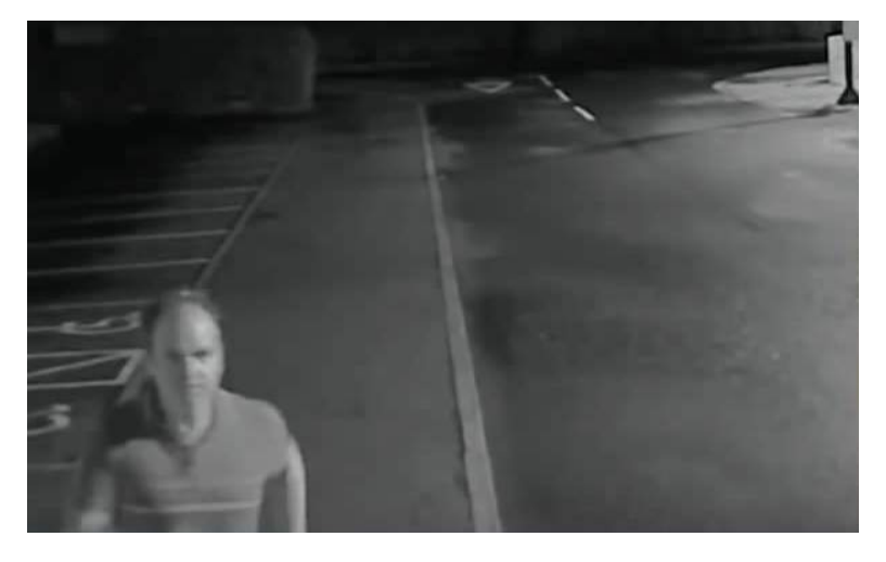
IndigoVision Ultra Camera