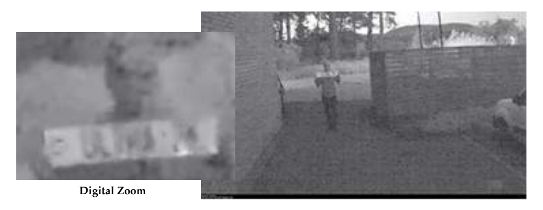
Standard HD Camera

Given the potential pitfalls, there is a strong case for adopting a camera which automatically goes to black and white at night, for example in a pitch black - 0.1 lux - scenario. With the drive for higher and higher resolution in cameras, without low light performance being handled correctly, there are more and more cases where sites have upgraded to HD (High Definition) cameras only to discover when night falls that - thanks to the levels of noise generated – the resulting images are no better than those from the SD (Standard Definition) cameras they replaced.