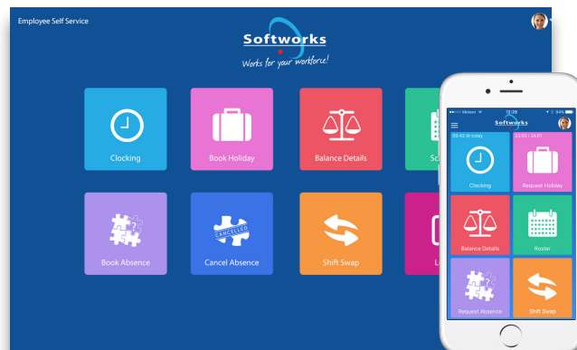
Employee Self Service & Mobile App