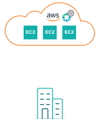
Cloud-Native EC2 Protection