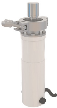
Option 4: Transport Locking Device