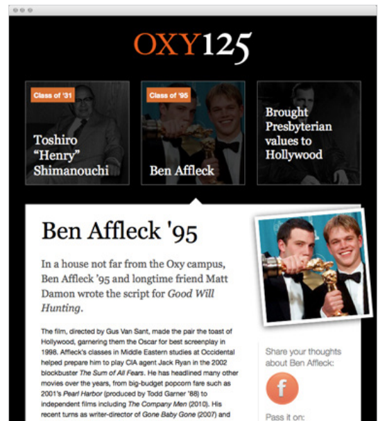
Alumni Profile Page