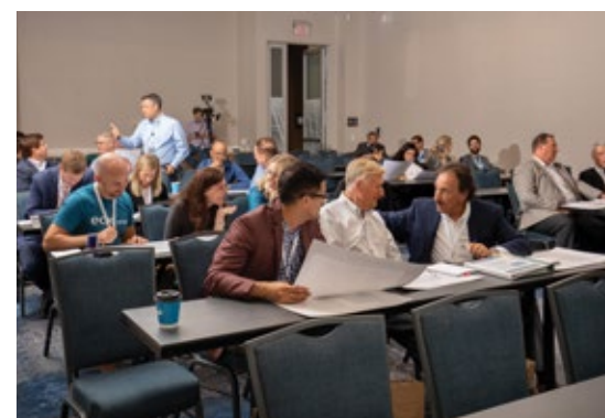
Tracks were filled with enthusiastic attendees ready to be inspired.

September was conference month and though this marked our 4th year, it was the first year as the Inspire Innovation Conference. And it was our biggest and best yet! We had a fantastic line-up of industry-leaders speak on a variety of topics, all centered around technological innovation and amplifying efficiencies. The two-day conference was also our launch for the company's rebrand as EOX Vantage and the unveiling of the 3.0 version of our product, the Enterprise Operating System.