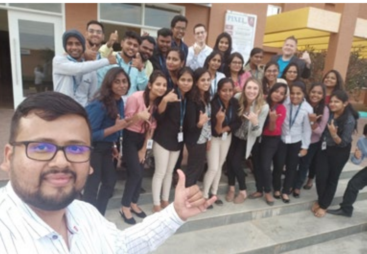
EOX Vantage showing our ISN clients a good time at our India office.