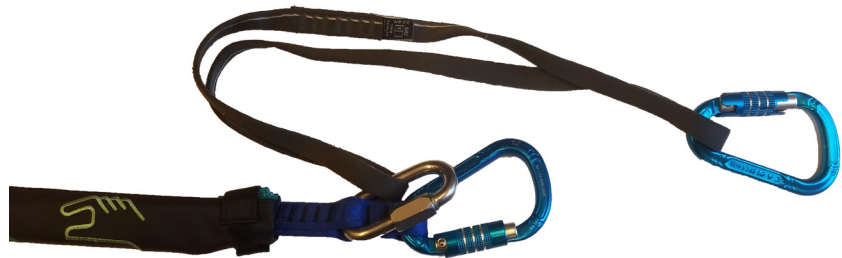
Figure 3: Sling attached to quicklink on secondary attachment point