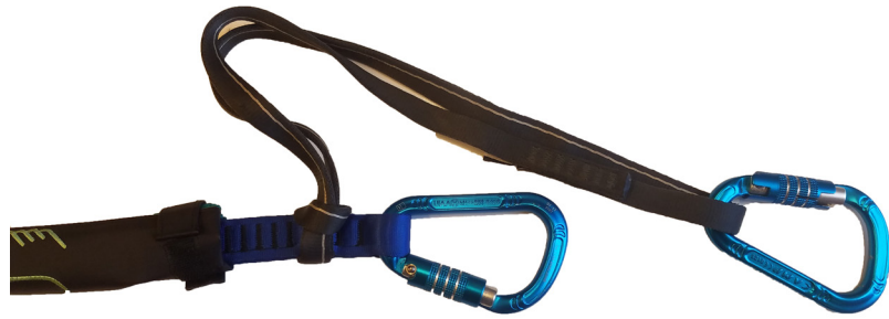
Figure 2: Girth hitched sling to secondary attachment point