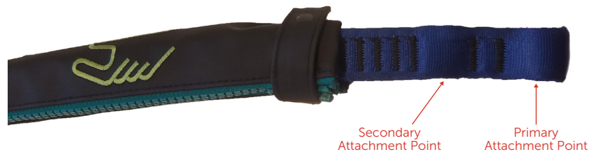
Figure 1: QUICKjump/QUICKjump XL attachment points