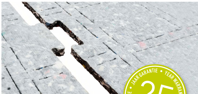
Puzzle shaped ProPlay ® sheets with expansion slots