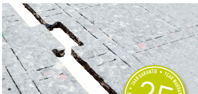
Puzzle shaped ProPlay® sheets with expansion slots