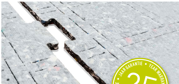
Puzzle shaped ProPlay ® sheets with expansion slots