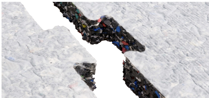
Puzzle shaped ProPlay ® for Playgrounds fall protection pad.