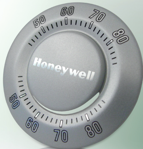
Engineering - expertise