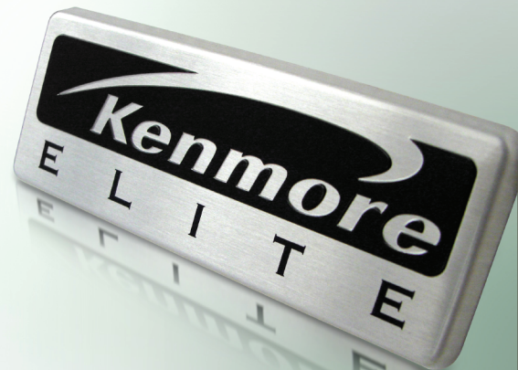
Stainless steel - aluminum finish