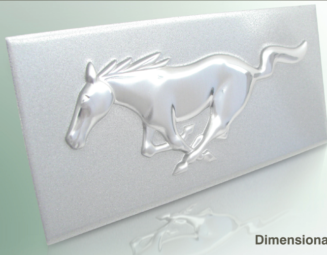
Dimensional - emboss