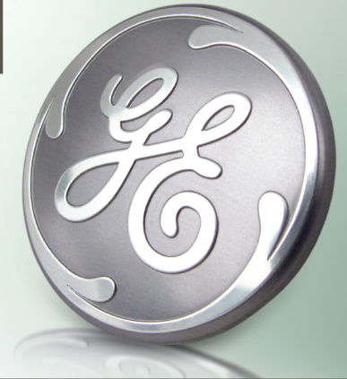
Formed - edge