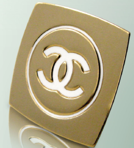
Color - metallic to opaque to transparent