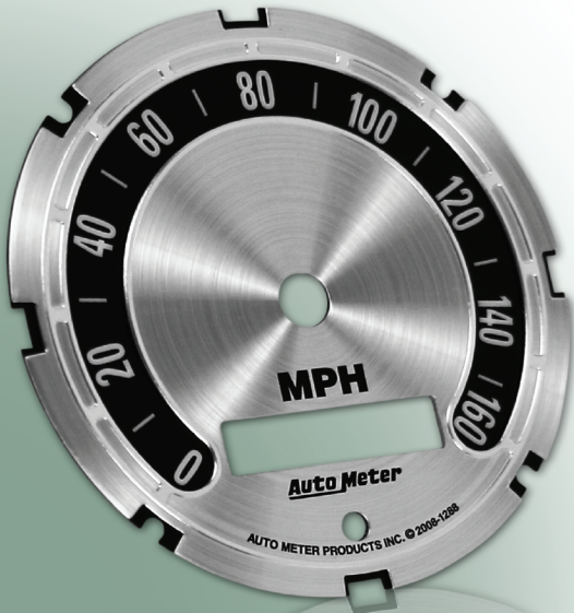
Integrated - polycarbonate and aluminum dial