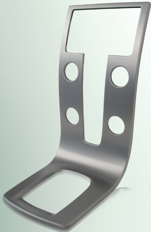
Extreme form - benchmark trim piece