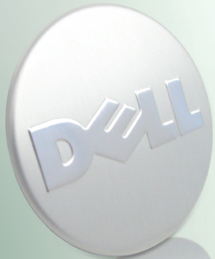
Assembly - options