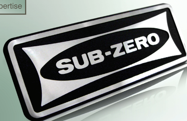
Crisp graphics - premium message