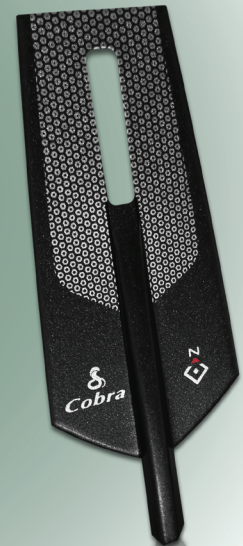
Premium trim - integrates into product design