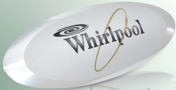
Custom color - development