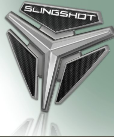
Emboss - multi-level