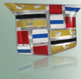
Diversity - large or small