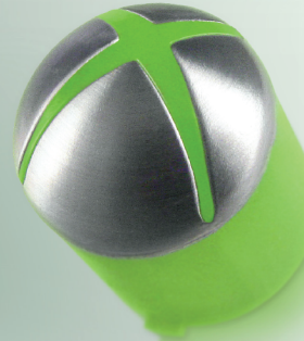
Functional - backlit aluminum