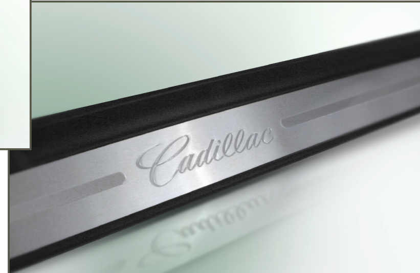
Aluminum in-mold - durability and dent resistance