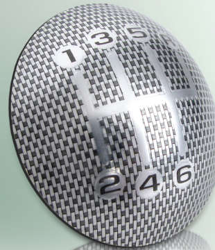
Textured - precision