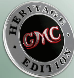
Design - collaboration