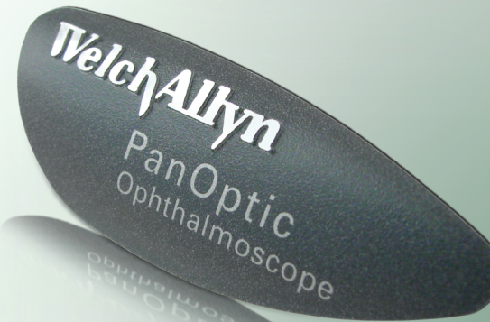
Formed diamond cut - distinction