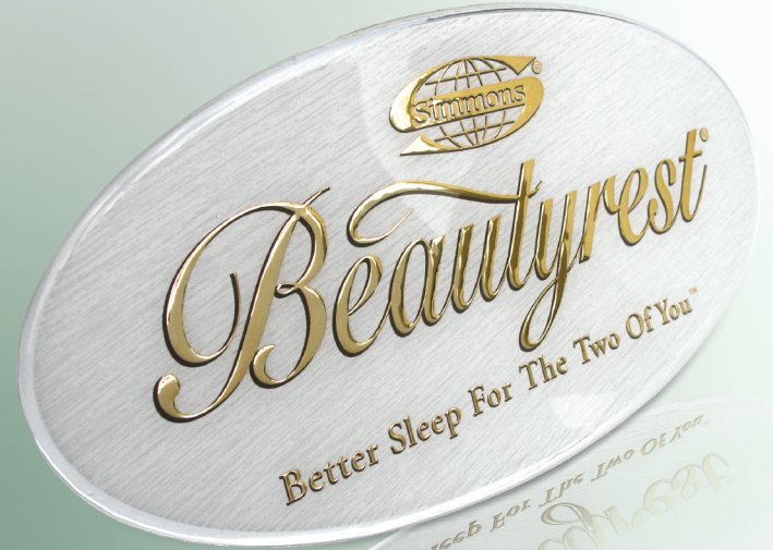
Flexlens - elegance