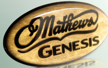
Norlens - depth