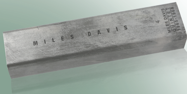
Possibilities - go beyond the obvious