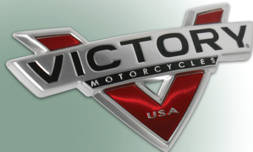
Quality - from start to finish