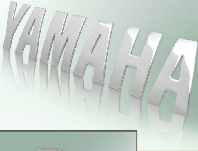
Individual letters - precisely aligned