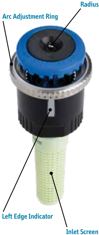
Radius Adjustment Screw