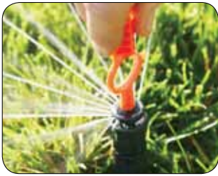
Easy radius adjustment.