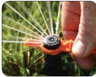
Easy arc adjustment.