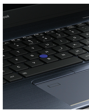
Dual Pointing Device