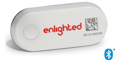
Enlighted Asset Tag