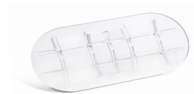
Asset Tag Mounting Bracket