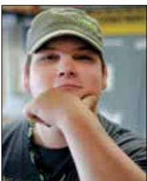
Jonah Curley Grocery