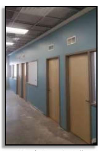
Maple Door Install