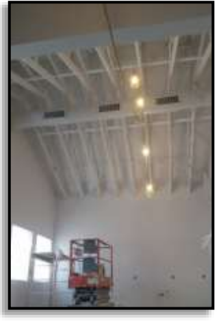
Seating Area Painting