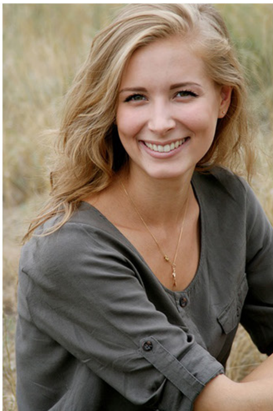
No Contrast With Background (especially with loose hair)