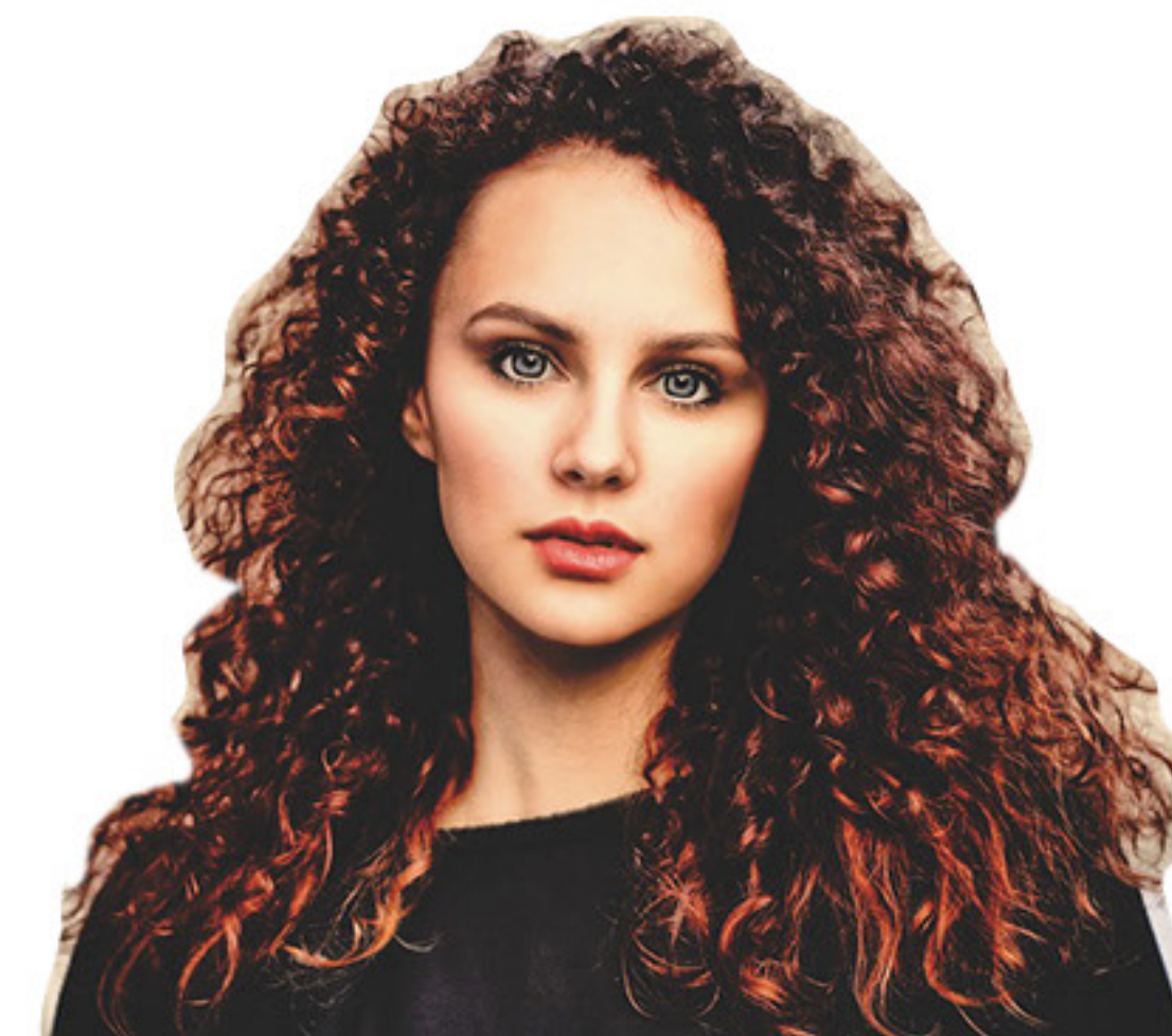
Already Cropped Photos (we cannot recover lost details)