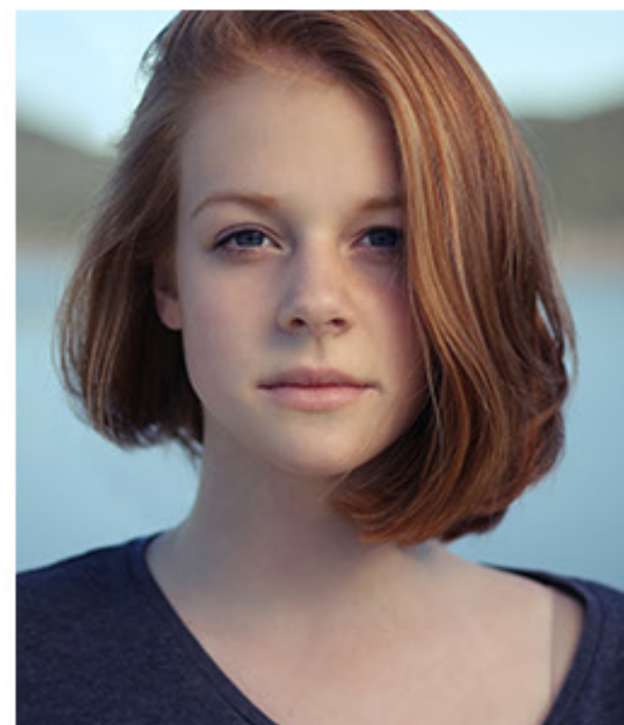
Cropped Sides / Top