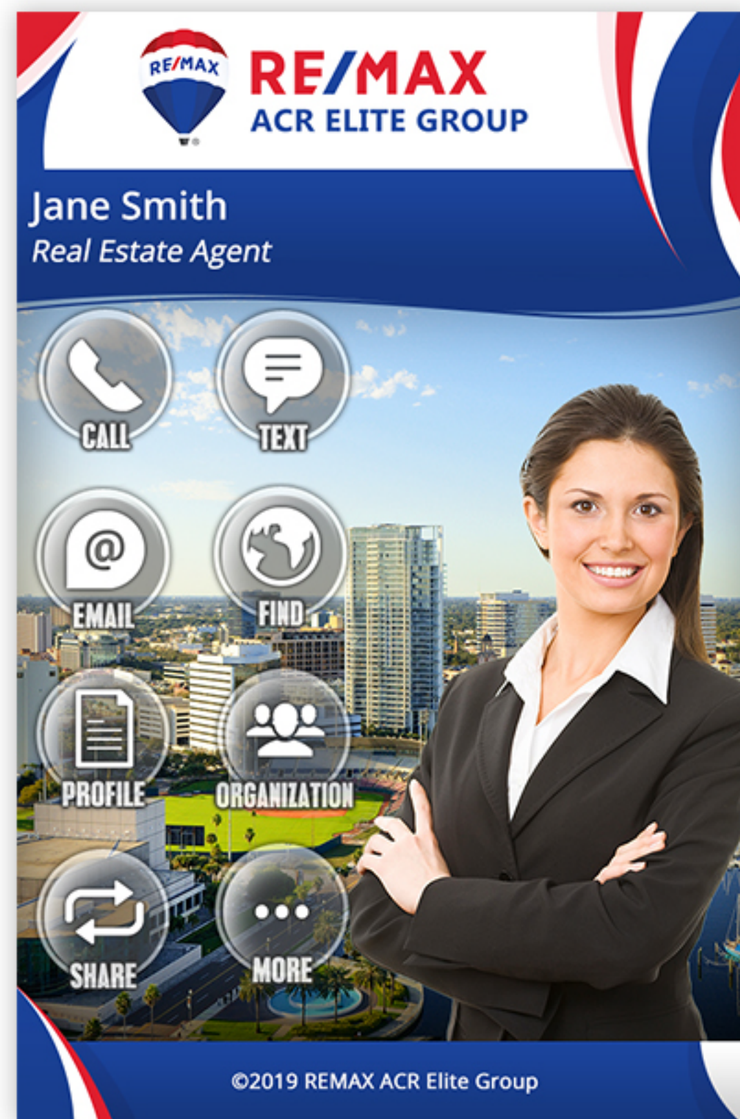
Full Profile SavvyCard

A Headshot version, where your photo is enclosed in a shape of some kind, usually used by those who don't want their photo to take up as much space or those who don't have a waist-up photo.