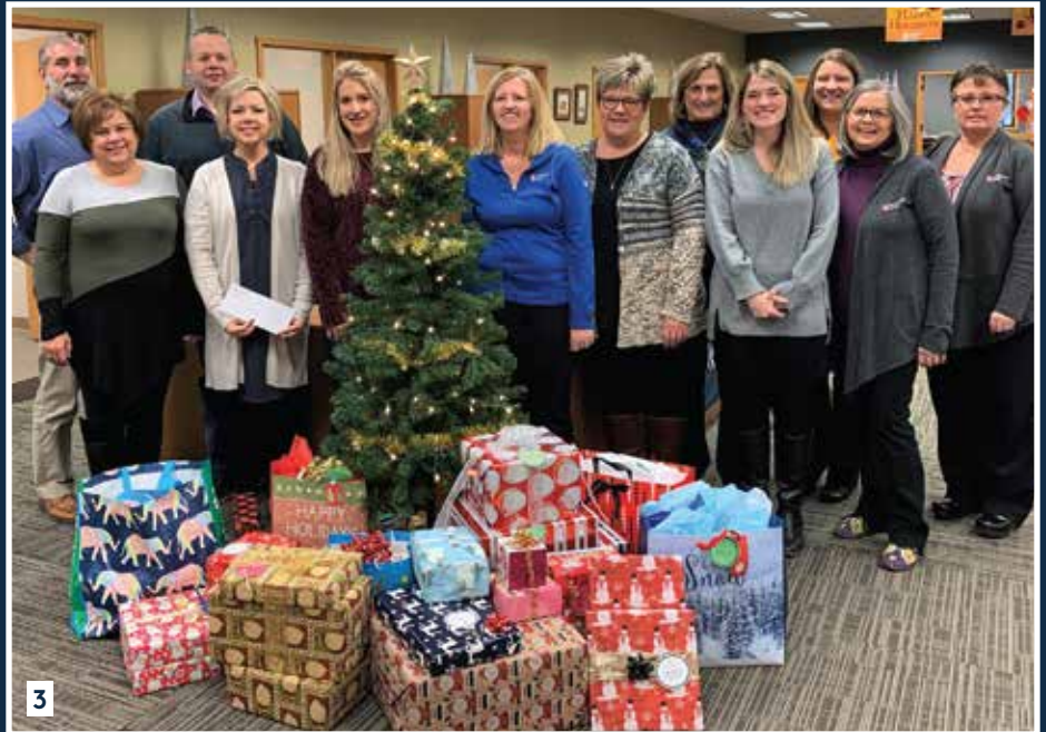
1. Rochester: National Night Out, 2. Marshall: Heart to Heart, 3. Montevideo: Giving Tree