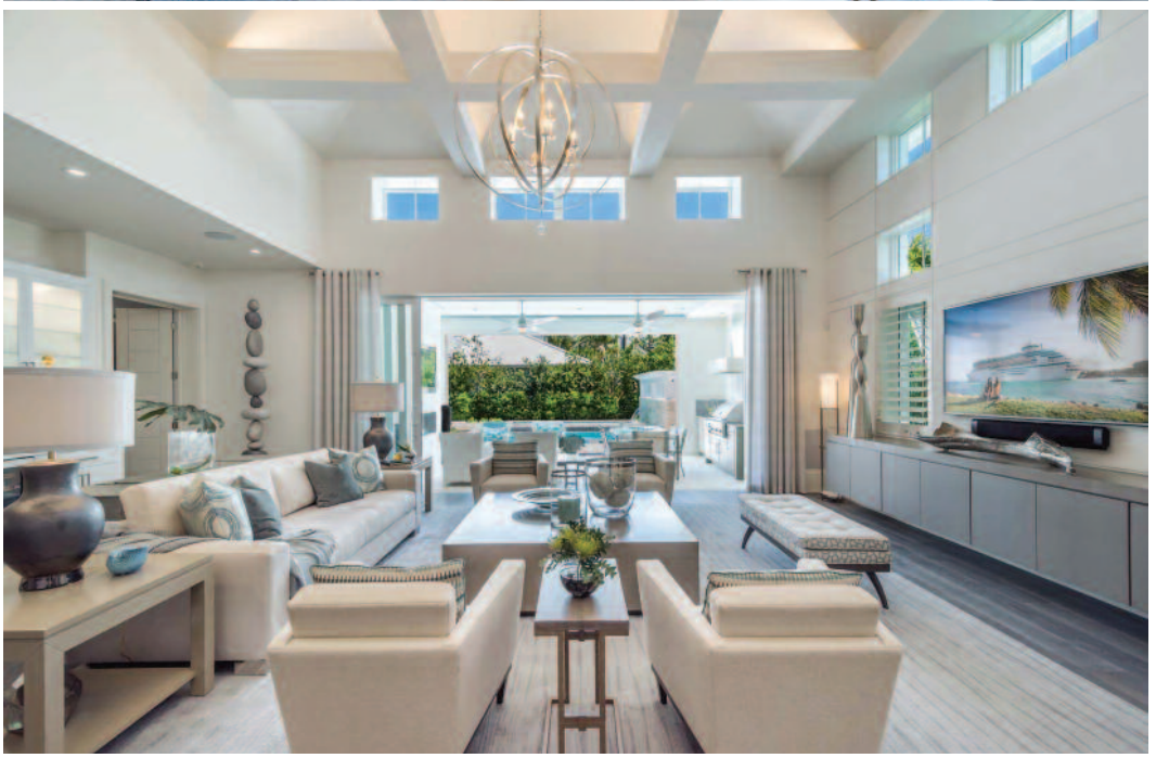
Its 4,182 square feet of living space was designed around an open-concept floor plan with entertaining in mind. Consider the expansive great room, filled with comfortable seating to encourage conversation and a large TV in a floating media cabinet for watching the big game with family and friends.