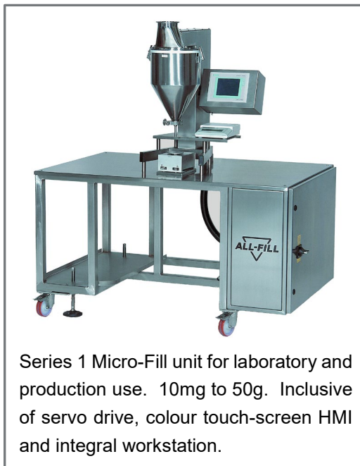
Series 1 Micro-Fill unit for laboratory and production use. 10mg to 50g. Inclusive of servo drive, colour touch-screen HMI and integral workstation.

Floor-standing pedestal and bench-top models are available in volumetric and gravimetric forms, with all 316L stainless steel contact parts, no-tools strip-down for cleaning and 304 stainless steel externals. All machines feature PLC control via colour touch-screen panel.