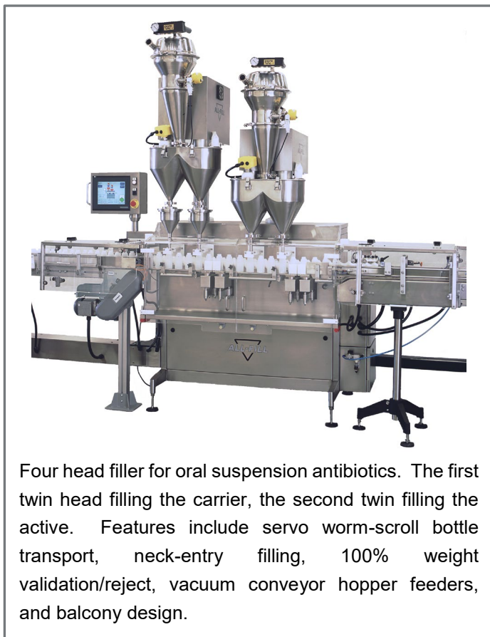
Four head filler for oral suspension antibiotics. The first twin head filling the carrier, the second twin filling the active. Features include servo worm-scroll bottle transport, neck-entry filling, 100% weight validation/reject, vacuum conveyor hopper feeders, and balcony design.