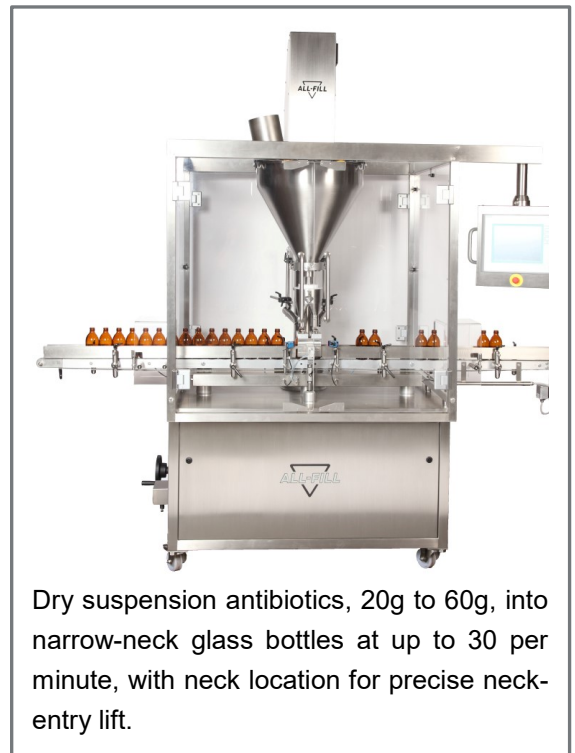
Dry suspension antibiotics, 20g to 60g, into narrow-neck glass bottles at up to 30 per minute, with neck location for precise neck-entry lift.

Bespoke and multi-head solutions are available, customer-designed to suit user requirements.