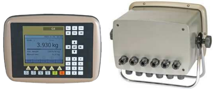
Panel Mount (PM)