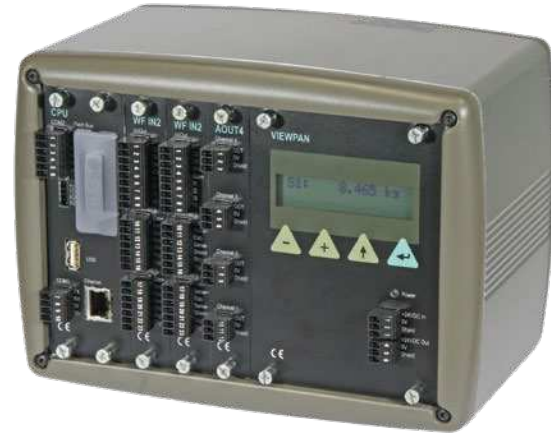
DIN-Rail Mount Unit

G4-RM instruments accommodate up to three different, easily installed, modules for advanced performance, more functional channels, custom applications, or repair. This provides customers with a highly flexible, upgradeable, single instrument system capable of weighing up to six independent vessels or scales. For web tension applications, up to six zones (rolls) can be monitored simultaneously. Inputs and outputs can be configured according to customer requirements.