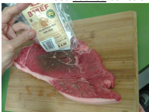
Choose some fresh meat