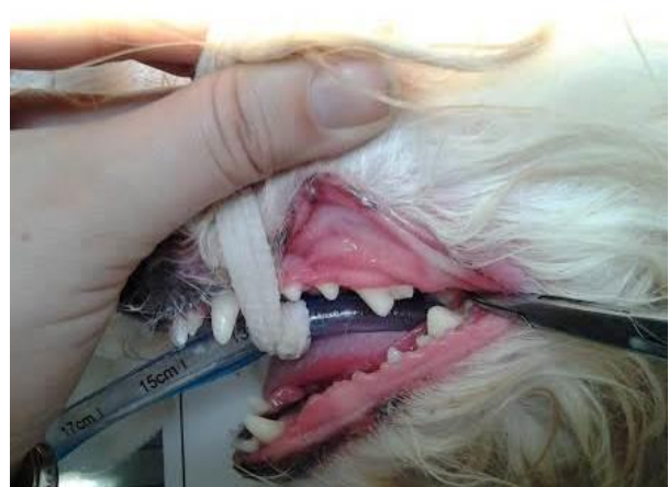
The same teeth after cleaning & polishing