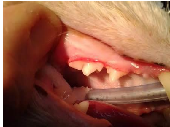
The same teeth after cleaning & polishing.

So, to reduce the formation of tartar on your pet's teeth and to keep the gums strong and healthy, we recommend teaching your pet to chew on a little raw meat (on the bone if possible) every day.