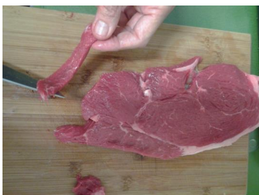
Strips are long and thin