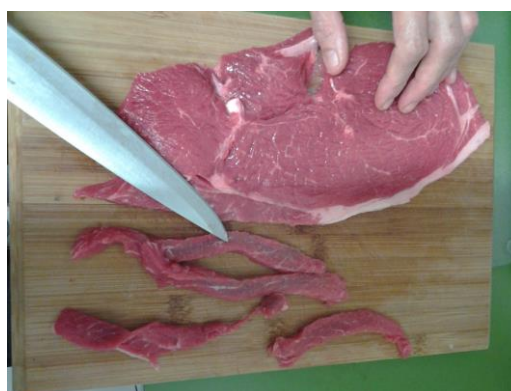
Cut many strips and freeze laid flat