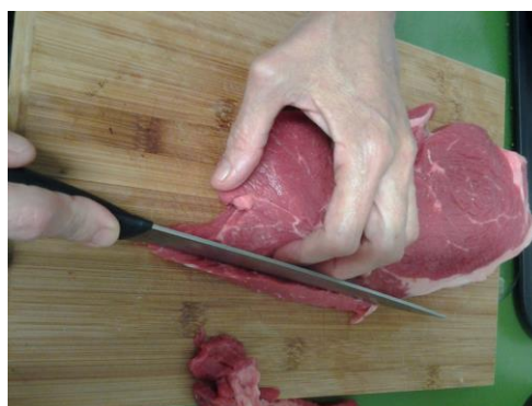
slice strips off a long side