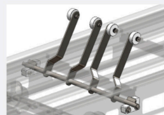
Integrated Belt Lifters