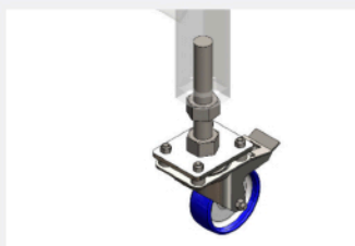
Stainless Steel Casters