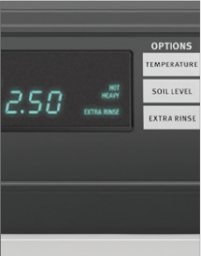
Screen image simulated.

The traditional agitator alternates between four distinct wash patterns and has three deep-water wash cycles to meet individual load needs while providing extraordinary wash performance.