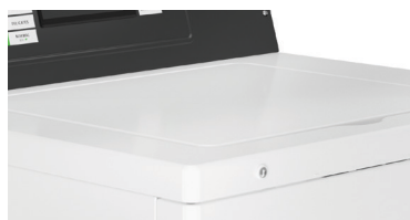
PREMIUM PORCELAIN ENAMEL TOP & LID