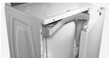
REMOVABLE FRONT PANEL