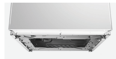
EASY-ACCESS STEEL BASE