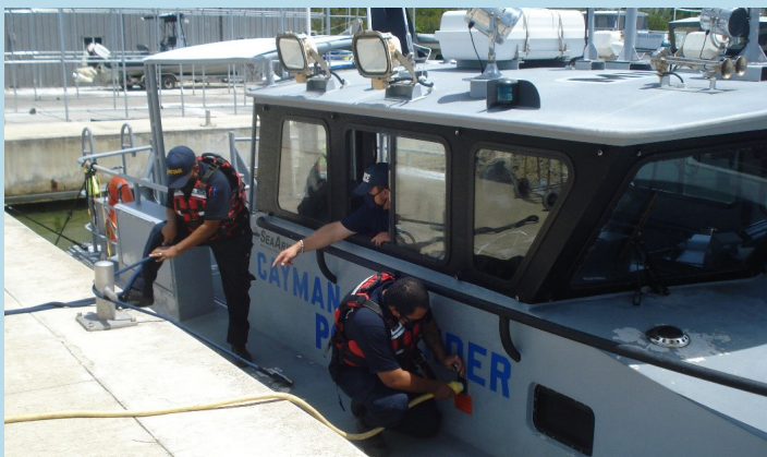
Officers from Customs and Border Control (left), CI Coast Guard/joint Marine Unit (middle) and CI Fire Service (right) share duties.