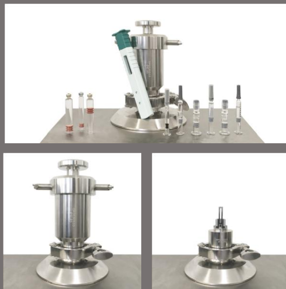
Bonfiglioli Engineering machines are equipped with a plunger stopper device to prevent any significant plunger movement and ensure product sterility.

Bonfiglioli Engineering leak testing technology can also be integrated and combined with Automatic Visual Inspection and Headspace Gas Analysis to support end user in required testing processes