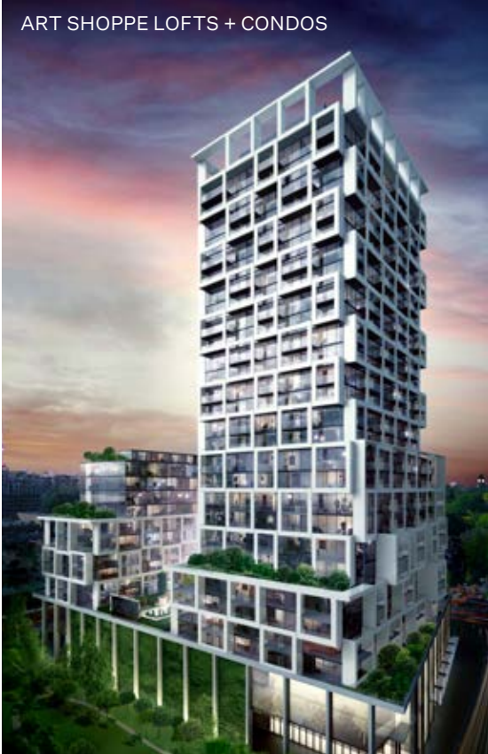
ART SHOPPE LOFTS + CONDOS

For over 25 years, Freed has been changing the face of the city with its unique brand of design-based development. The company, with 9,100 units and $5.48 billion in real estate assets developed, has been the driving force behind the remarkable transformation of King Street West and beyond. A Freed property is more than just a building, it's a lifestyle hub. It's a place where people work near where they play, in buildings that make a true design statement. Freed's portfolio includes hospitality ventures, resort communities and commercial spaces that become home to residents and some of the city's best retail tenants alike.