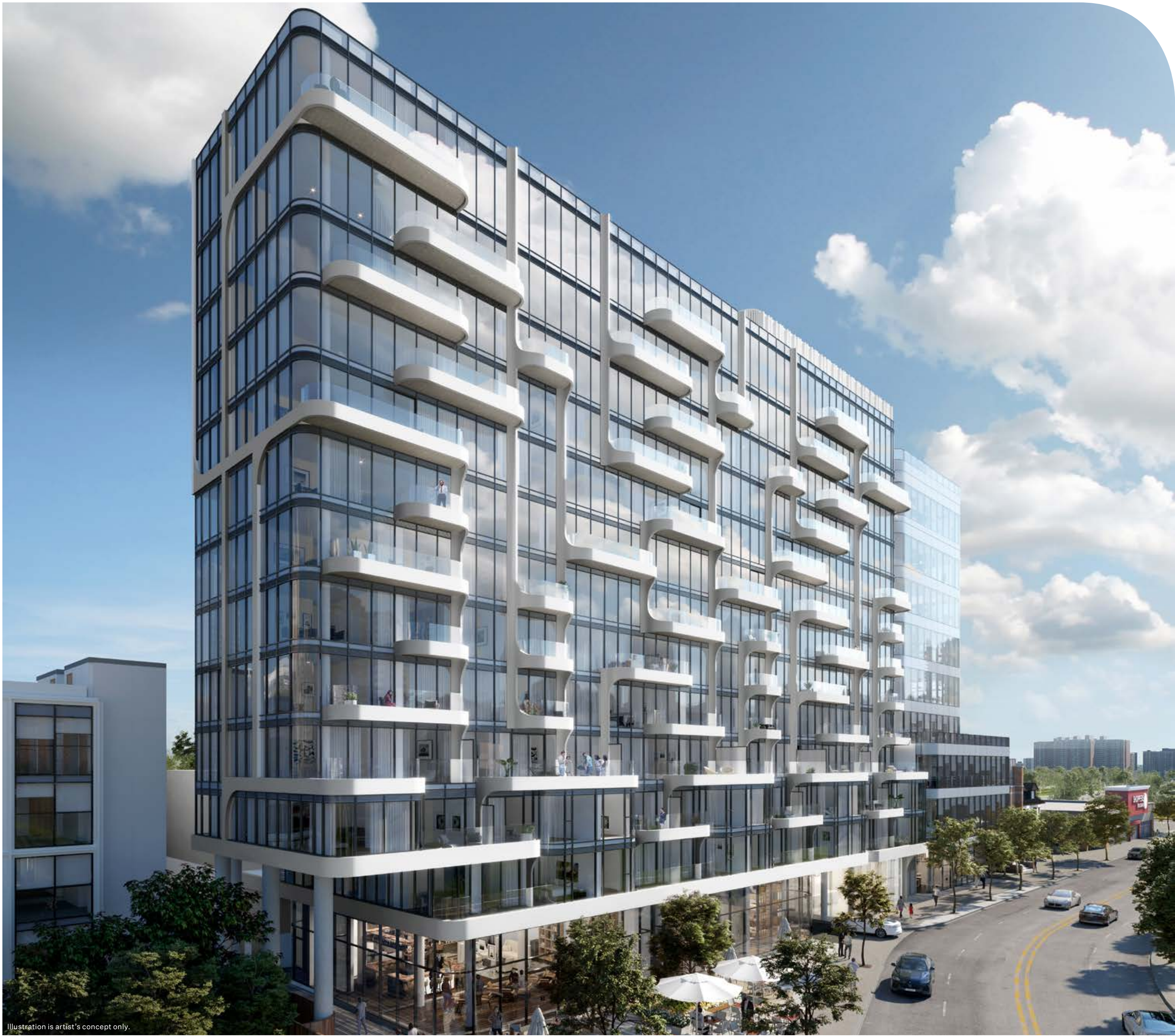
Illustration is artist's concept only.