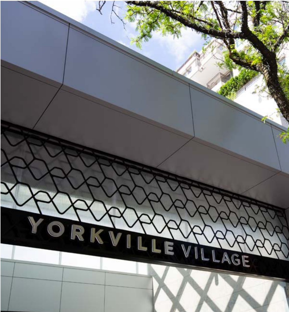
RIGHT Whole Foods Market