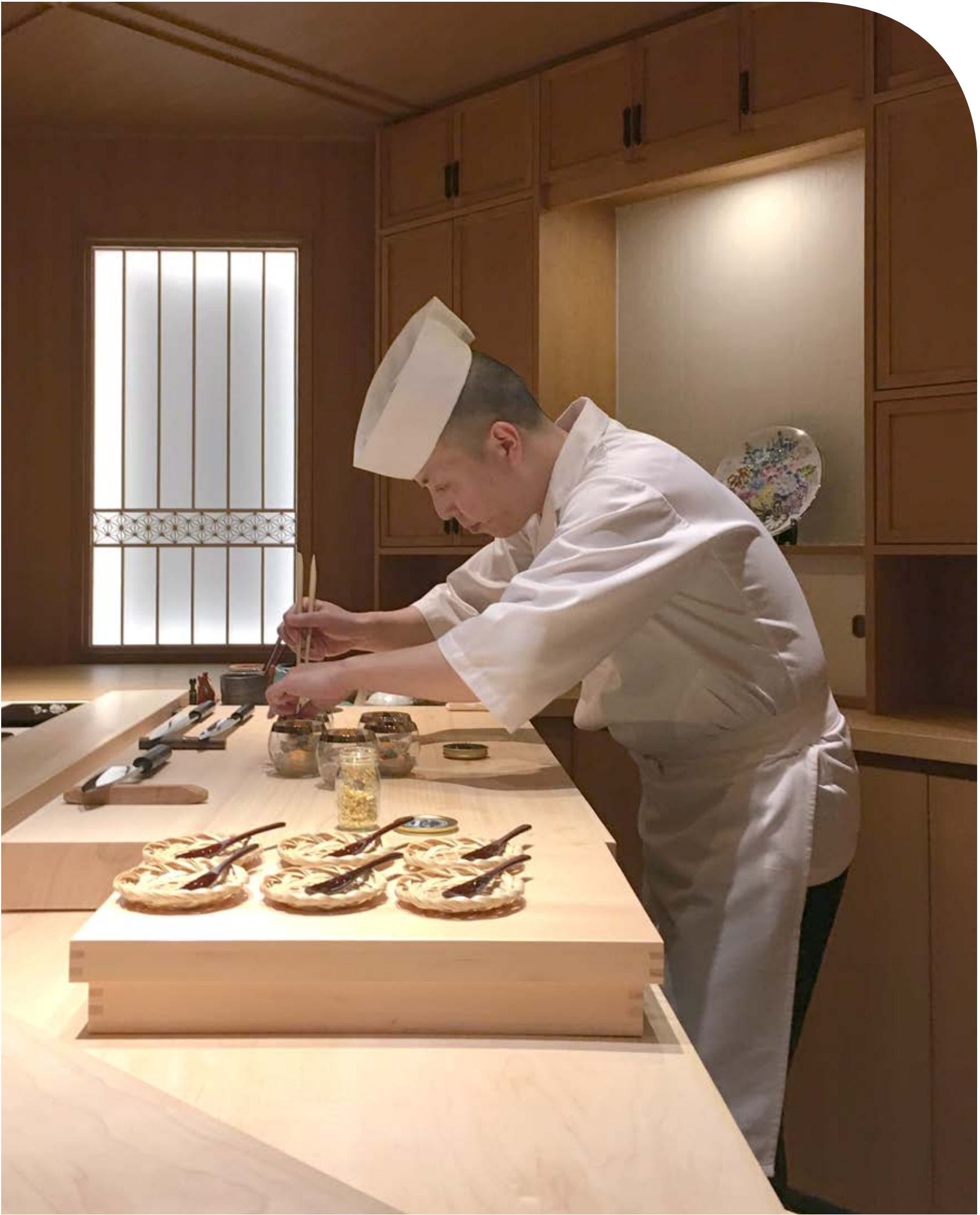
Celebrity-spotting is a Yorkville tradition – and with restaurants like these dotting the area, it's no wonder that both the famous and not-so-famous often gravitate here.