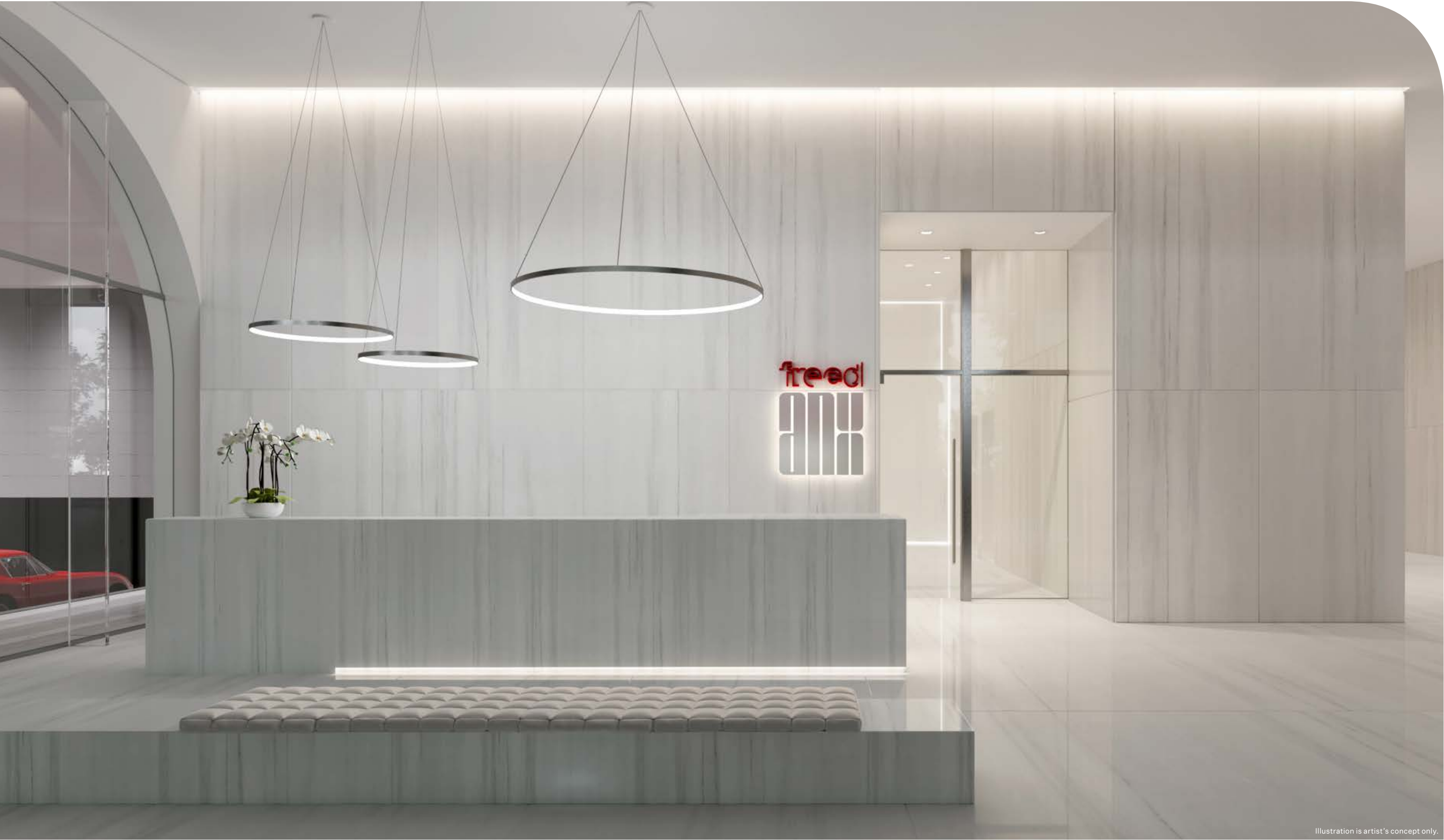
Illustration is artist's concept only.