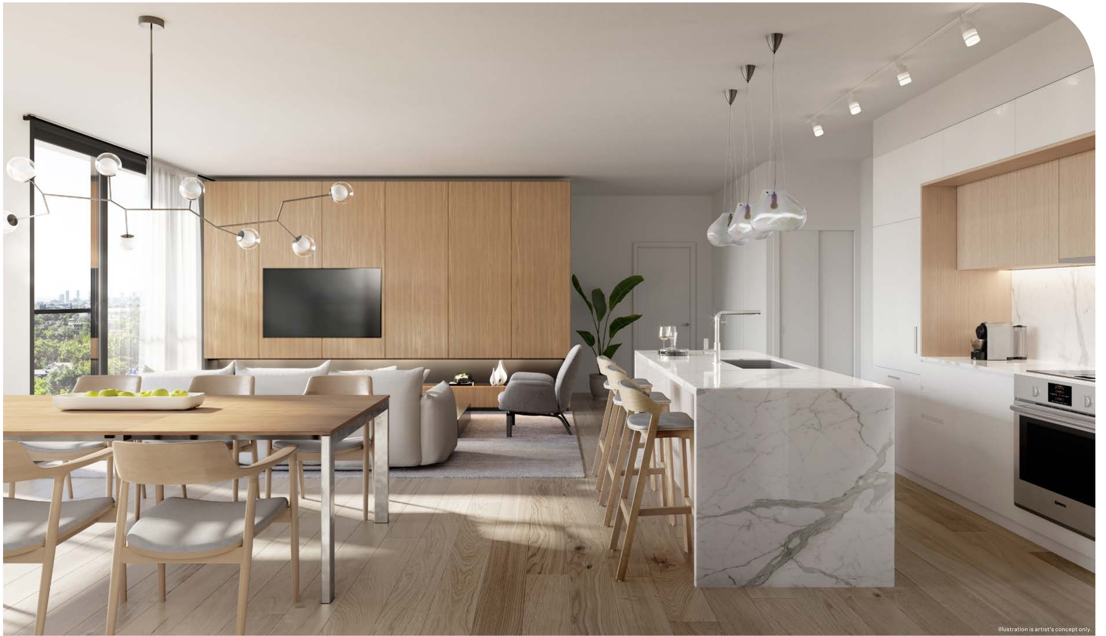
Illustration is artist's concept only.