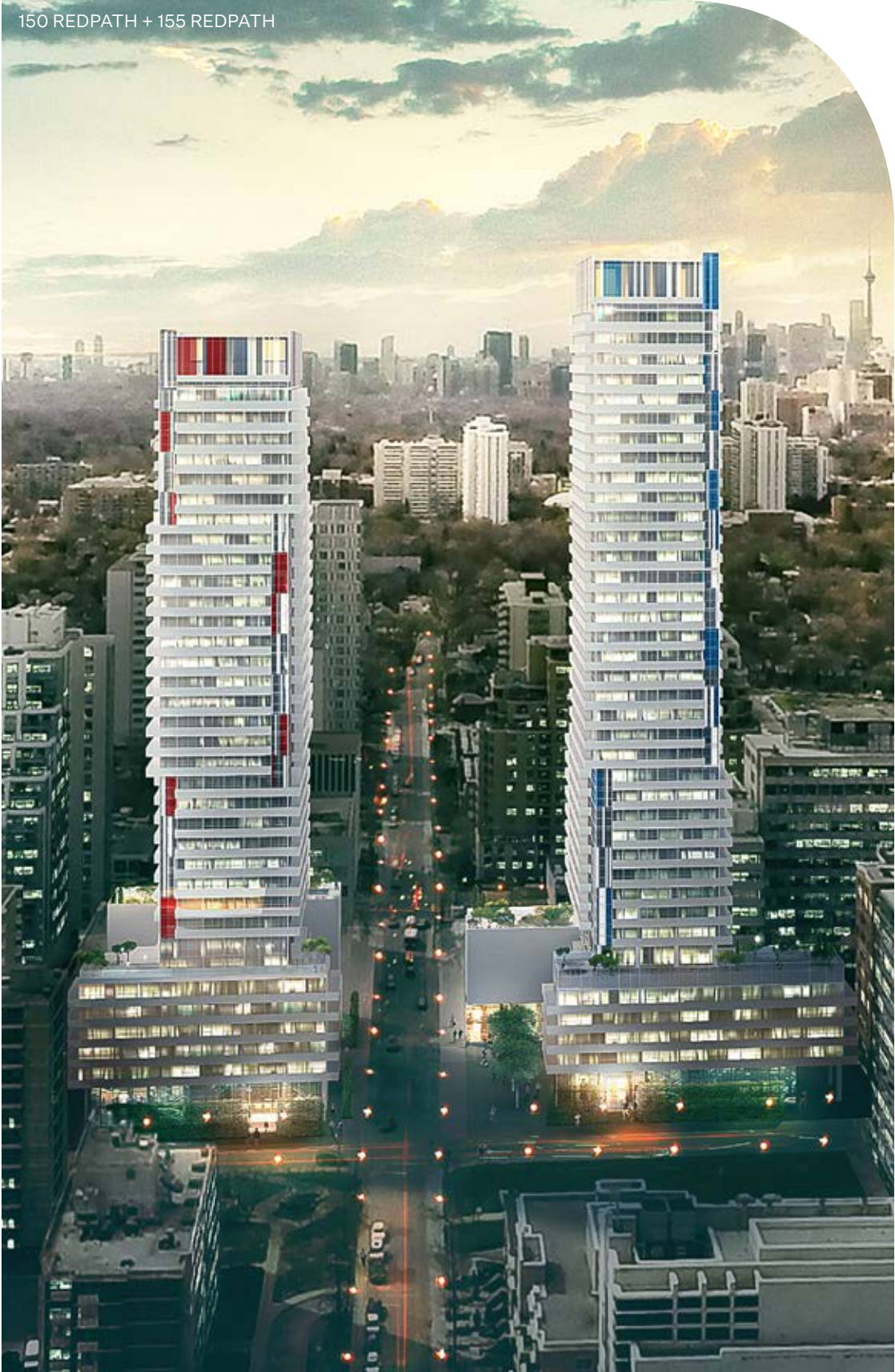
150 REDPATH + 155 REDPATH