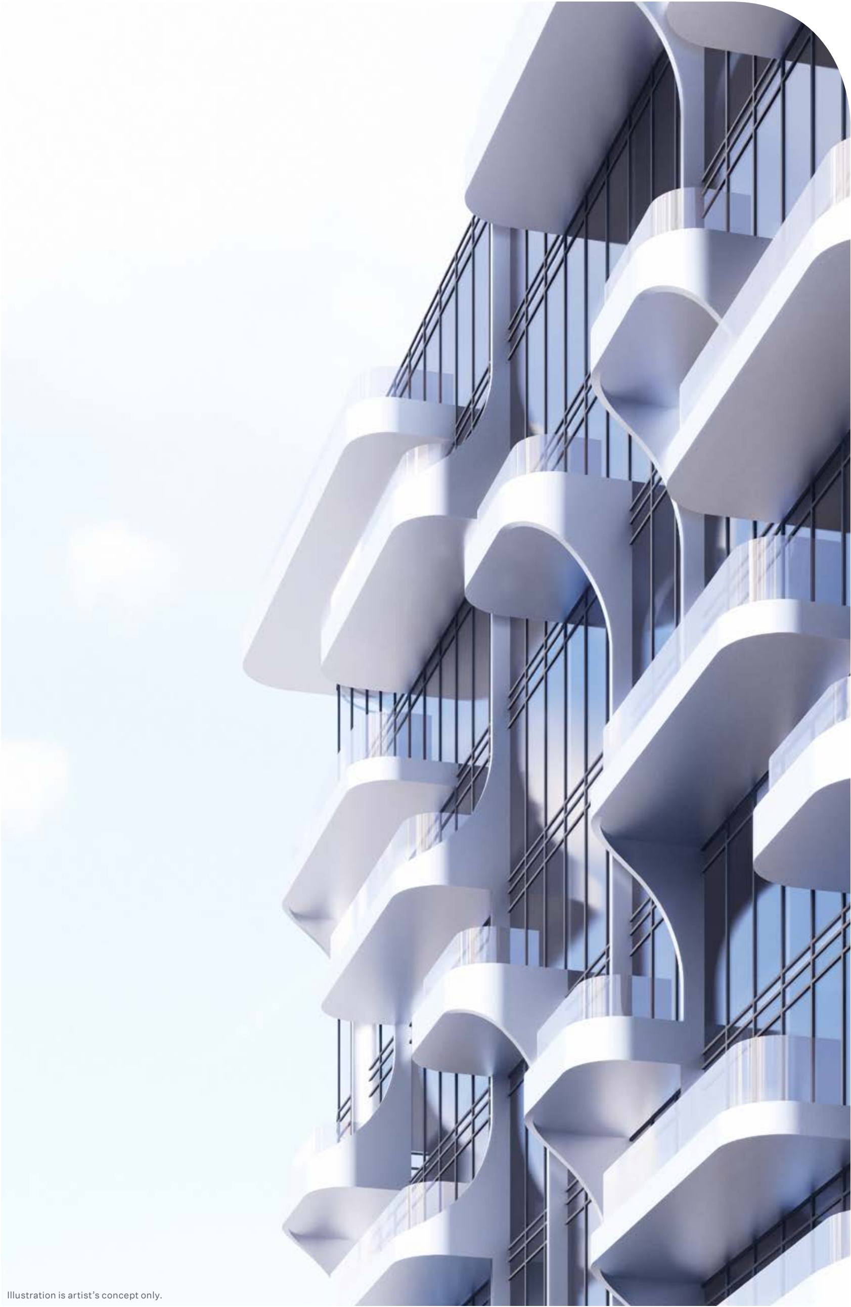
Illustration is artist's concept only.

The bold blend of steel and glass cuts an impressive swath through the cozy confines of the Annex neighbourhood. ANX is redefining the formerly industrial stretch of Dupont with a striking, futuristically minimalist statement. The long panes of glass stretch from top to bottom in thin vertical rectangles, highlighted by sleek metallic trim. This contrasts beautifully with the smooth curves of the balconies, making the whole more than a sum of its dramatically unique parts.