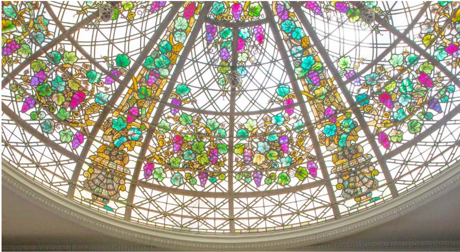
LEFT Casa Loma Lookout Casa Loma Conservatory

Perfectly preserved in all its ornate splendor. Visitors can revel in the opulence of a bygone era.