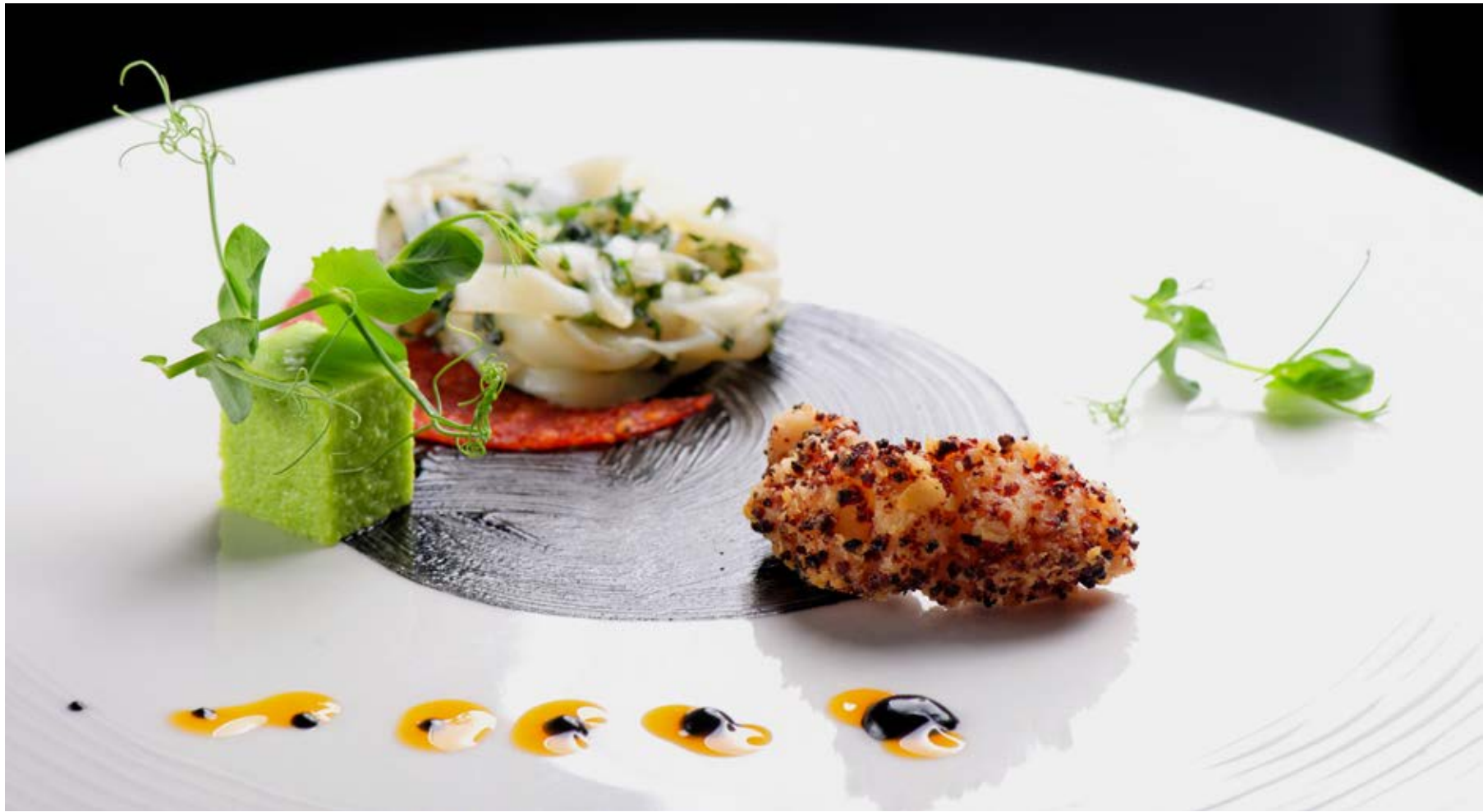
LEFT Fat Pasha Opus Restaurant