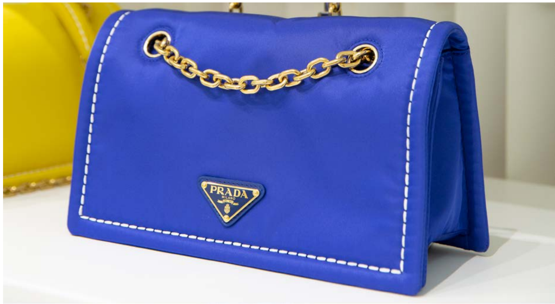
LEFT Louis Vuitton Prada

Whether you're making your way down Bloor Street, or exploring Yorkville, you'll quickly realize that this is a place that takes style seriously.