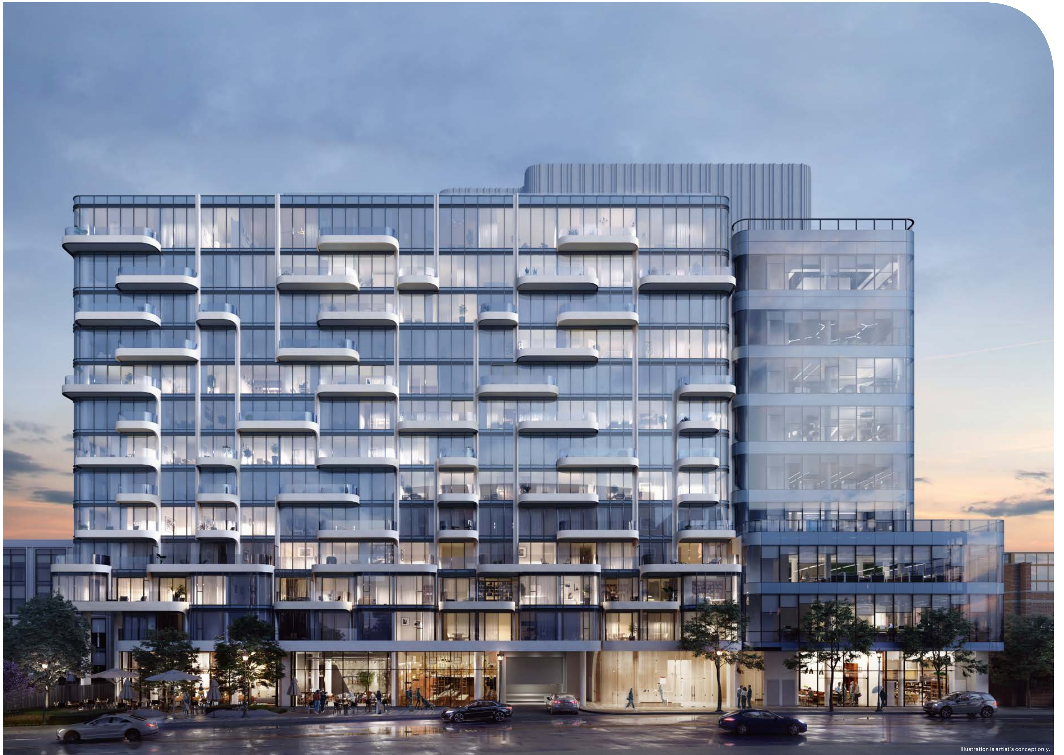
Illustration is artist's concept only.