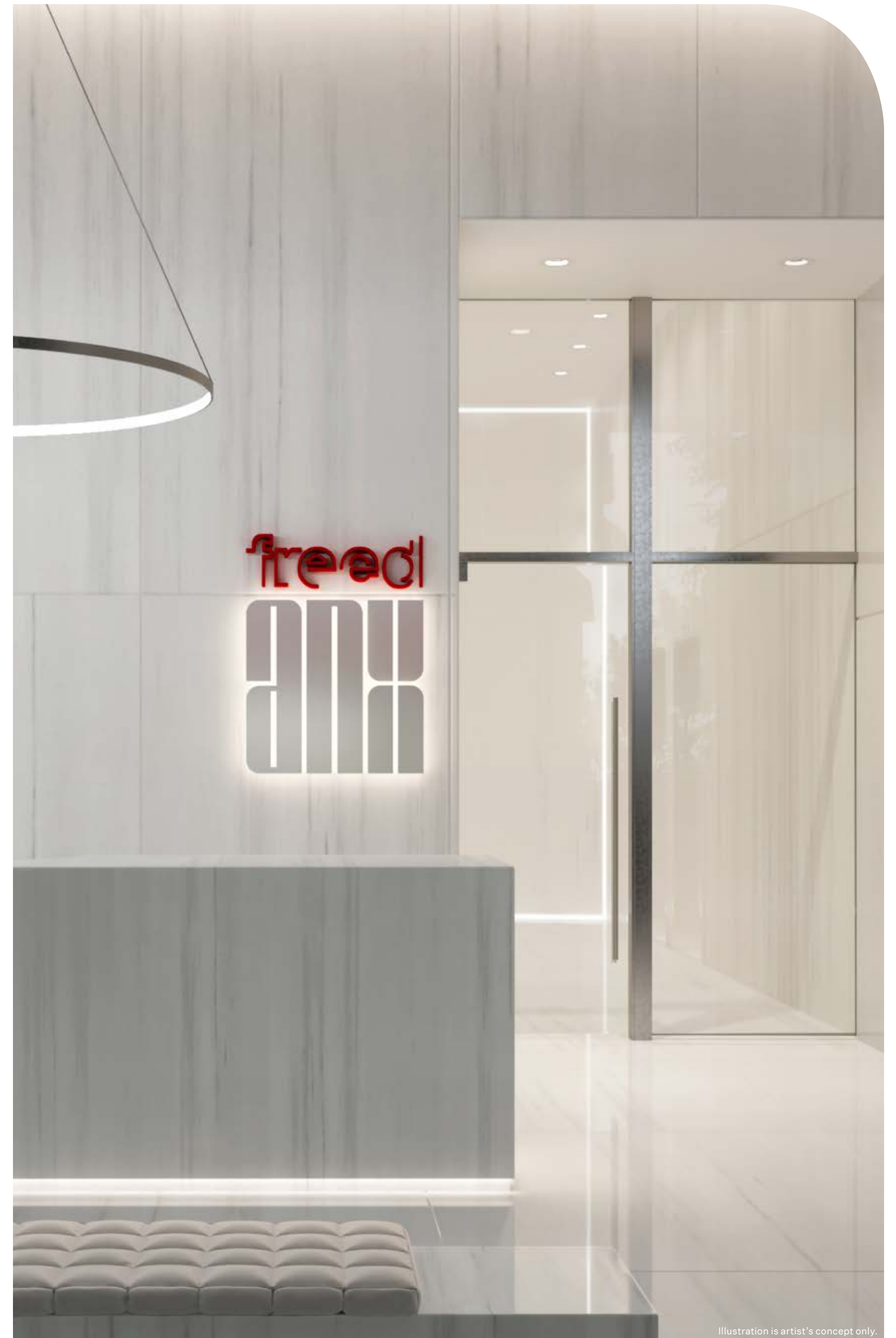
Illustration is artist's concept only.

Keeping with the strikingly minimal exterior, award-winning designer Johnson Chou is creating an interior landscape that reflects a blend of luxury and refined restraint. It's your entry to a world of amenities as artfully designed as the building itself.