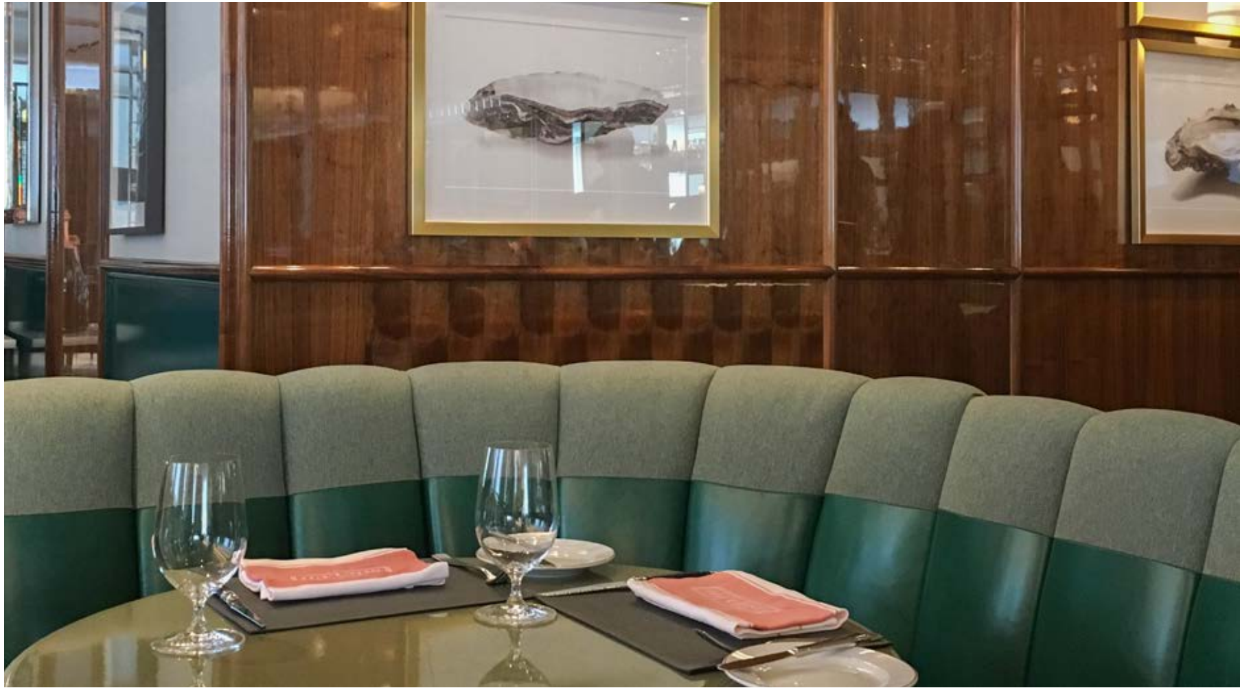
LEFT Sassafras Café Boulud by Four Seasons