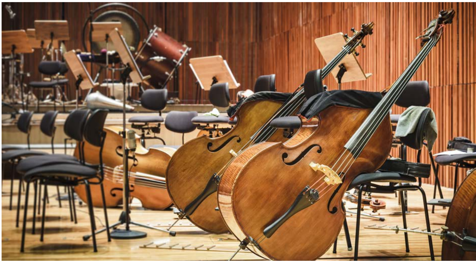
LEFT Randolph Centre for the Arts Koerner Hall