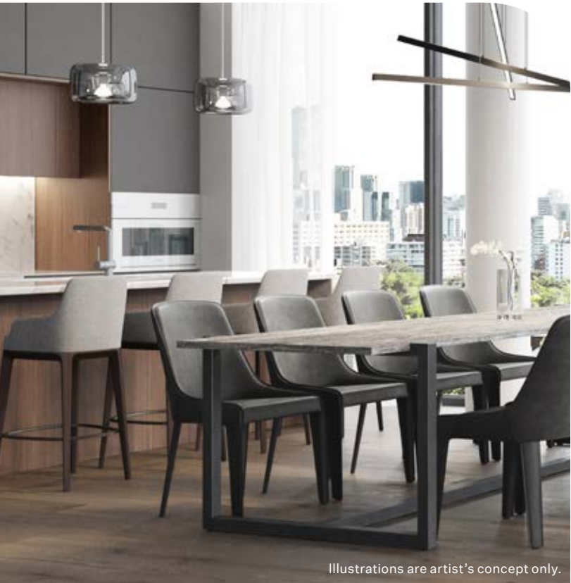
Illustrations are artist's concept only.