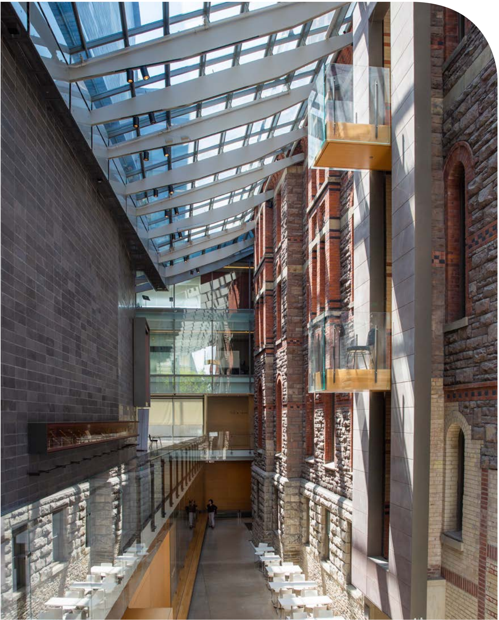
For classical encores, take your pick of Koerner Hall, Randolph Centre for the Arts, the Music Gallery, and Tafelmusik Baroque Orchestra. Not to mention, you're surrounded by every big name in the art world with galleries like Hazelton, Alan Klinkhoof and Galerie de Bellefeuille all nearby.