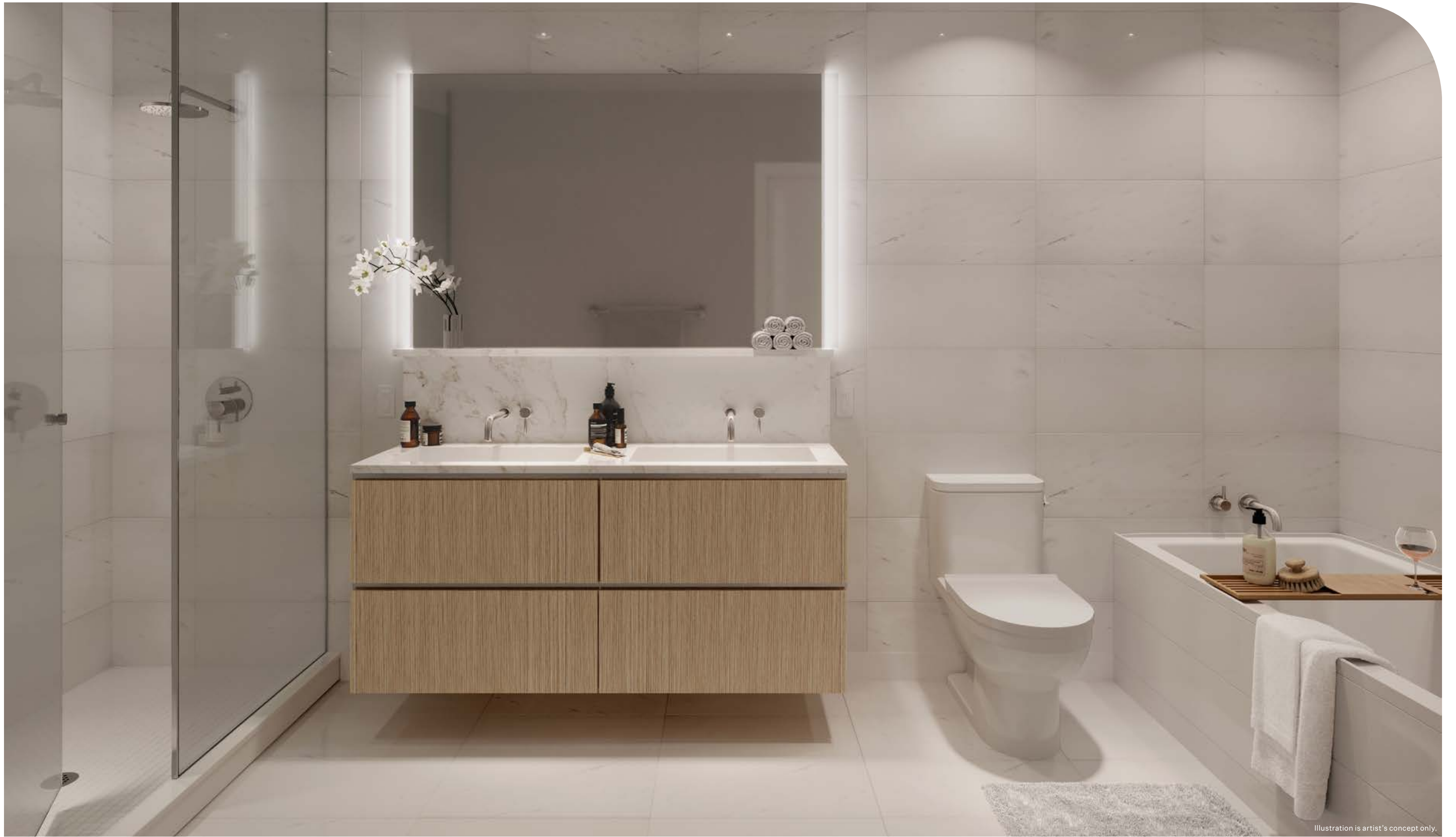
Illustration is artist's concept only.