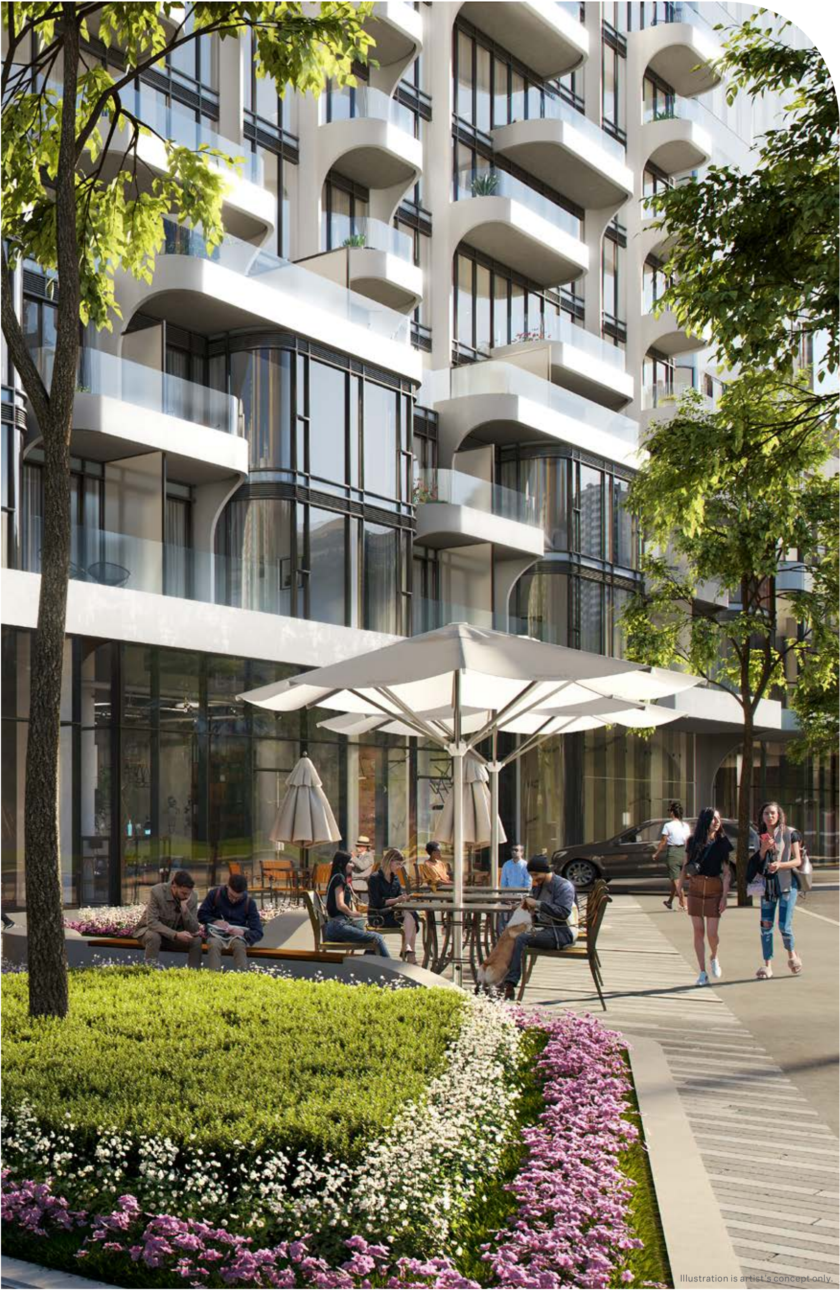
Illustration is artist's concept only.

Welcome to the New Dupont, a stretch of city street that is quickly emerging as one of Toronto's most desirable neighbourhoods. Here, beautiful heritage homes mingle seamlessly with distinctly modern structures, with ANX forming one of the centrepieces of the area.