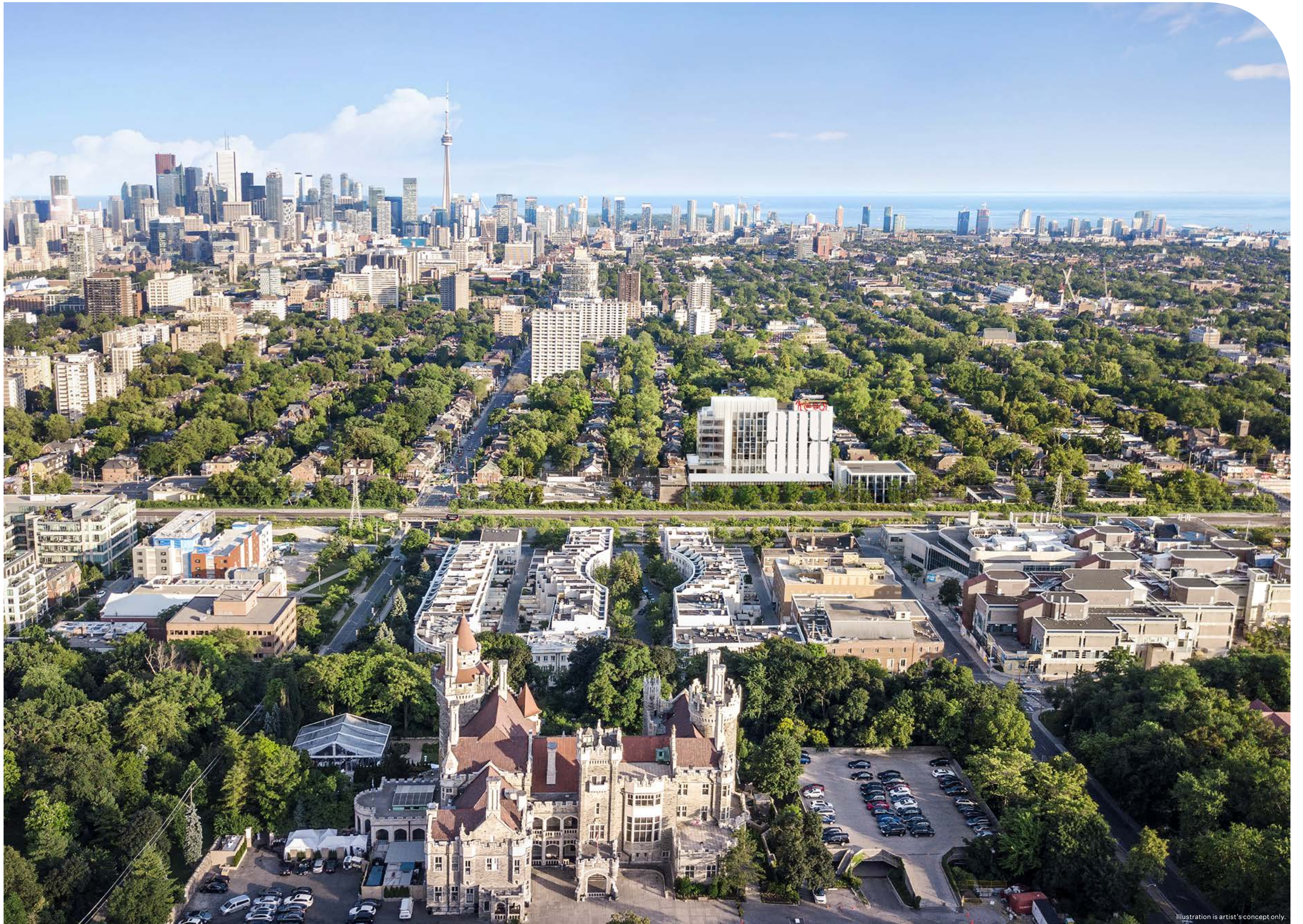
Illustration is artist's concept only.