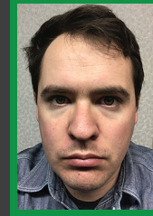
68% - match