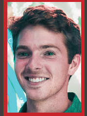
5% - no match