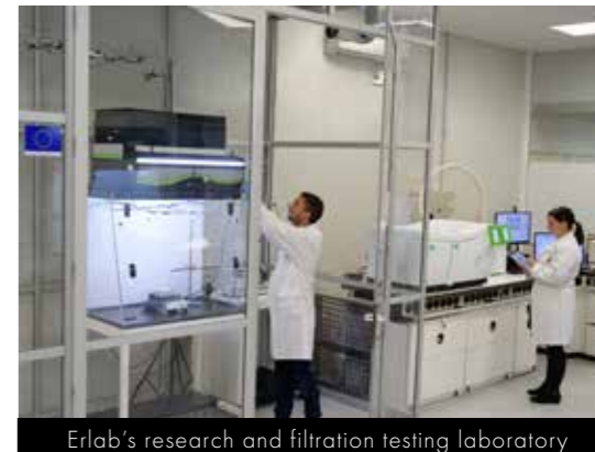
Erlab's research and filtration testing laboratory