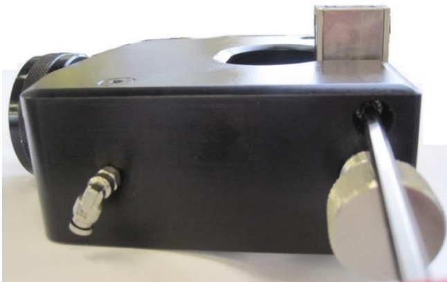
3) Repeat process on the other side.