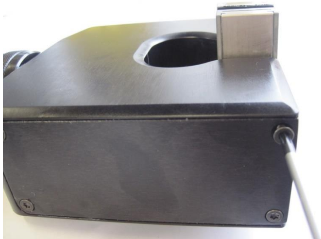
1) Remove 4 Torx Screws and Cover plate with tool provided.