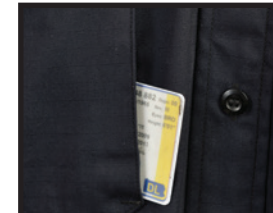
CHEST POCKETS WITH SIDE COMPARTMENTS