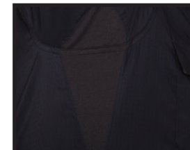
FLEX UNDERARM MESH VENTS