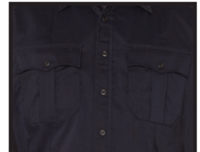
CHEST POCKETS WITH VELCRO CLOSURE