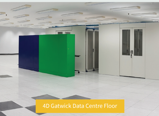
4D Gatwick Data Centre Floor

Industry leading cyber solutions as an integrated approach to strengthen your overall security posture such as Next Generation Firewalls, DDoS protection, Managed Backups, and Vulnerability Scanning