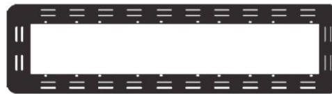
Backplate for 12",5-Section louvered ,flat