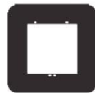
Backplate for 8", 1-Section Signal,flat

*All clusters require the additional Cluster Hardware Kit for attaching the filler strips to a variety of mounting hardware options