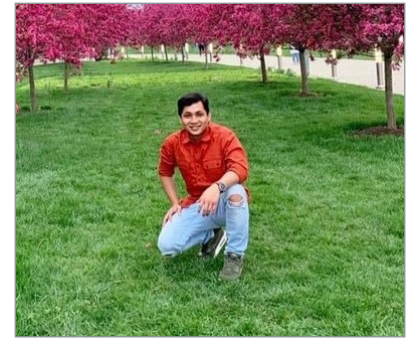
Bunterm Phouer Electronic Engineering