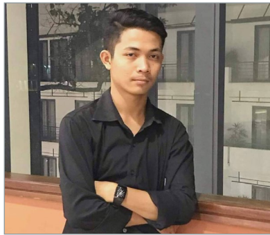
Yubous Tang Information Technology