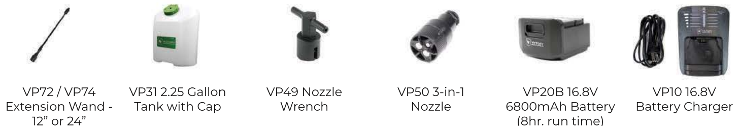
VP72 / VP74 Extension Wand - 12" or 24"