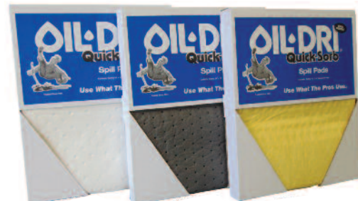
Available in Oil Select, Universal and High Visibility.