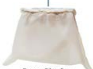
Dacron Filter Bag 122-3222-14