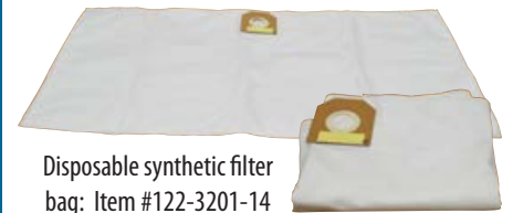
Disposable synthetic filter bag: Item #122-3201-14

The HEPA filter is individually tested and certified to be 99.97% efficient at .3 microns according to IEST-RP-CC001 test requirement.