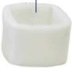
Spacer Sleeve 128-7503-14