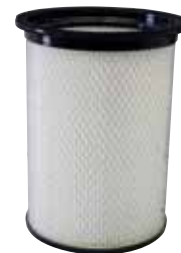
HEPA Filter: Part # 127-3320-14

For More Information Visit SterlingNA.com Or Call 844-822-7787 (844-Vacs R Us)