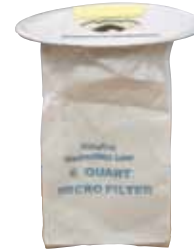
Disposable Paper Bag: Part # 122-3226-14

The HEPA filter is individually tested and certified to be 99.97% efficient at .3 microns according to IEST-RP-CC001 test requirement.