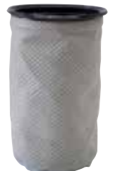
Cloth Bag: Part # 122-3229-14