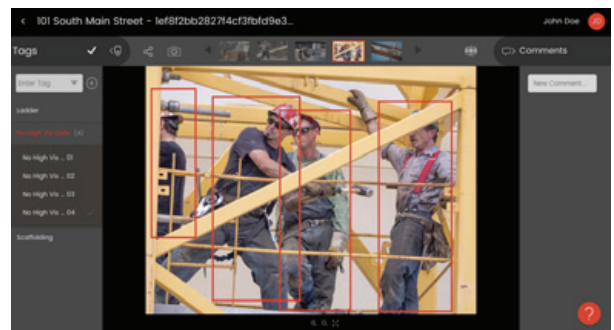
Image tagged as workers having "No high visibility PPE"

The Smartvid.io Smart Tagging engine, nicknamed "VINNIE", leverages machine learning (also called "Deep learning") technology powered by NVIDIA. NVIDIA's Quadro M6000 and Quadro GP100 boards power the deep learning training and model production hardware used by Smartvid.io to build their vision and speech models tailored to the needs of construction. When Skanska uploads photos and videos to VINNIE, NVIDIA's GPUs power the Amazon cloud services doing the real time analysis. Smartvid.io was selected as one of the top two "most disruptive AI companies in 2017" by NVIDIA from a pool of over 600 candidates.