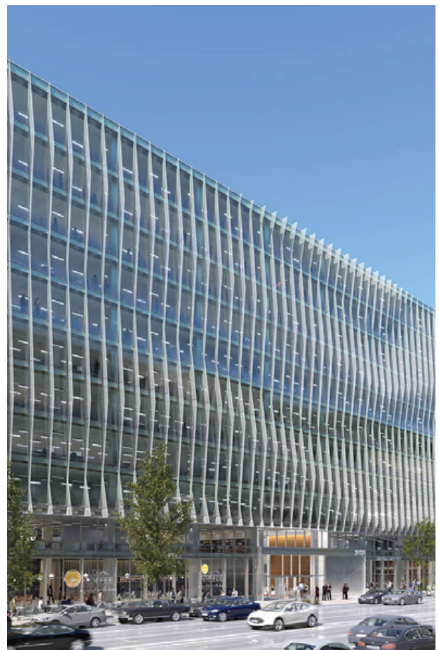
2112 Pennsylvania Avenue, Washington DC