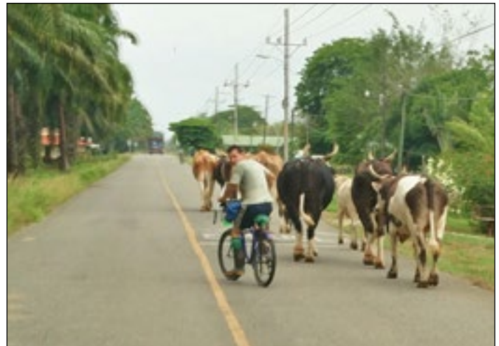
Rush hour in Costa Rica