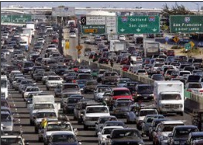
Rush hour in the United States