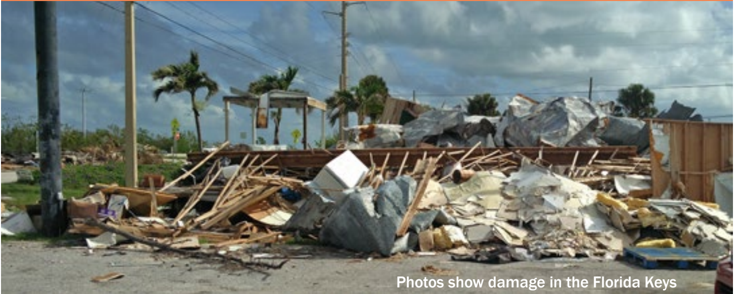
Photos show damage in the Florida Keys

Here we sit in a hotel room in Orlando impatiently waiting permission to return to our home and office in Key West. We are apparently one of the fortunate ones. Our house appears to still be intact via the satellite photos that the Navy has posted online for those who have not yet been permitted to return.